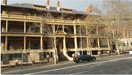
Margaret Graham Building, Frome road frontage

Use these heritage-listed buildings on Park Lands instead!