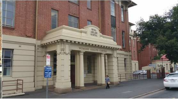
Women's Health Centre, North Tce