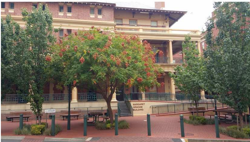
Margaret Graham Building (rear)