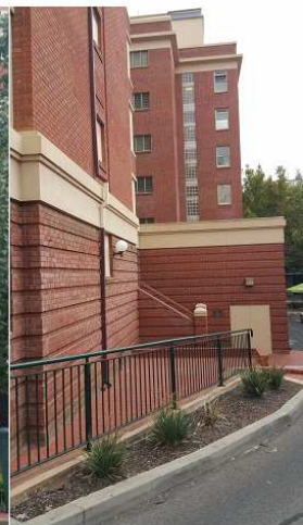
Eleanor Harrald Building, Frome Rd

Re-purpose our built heritage - don't take away more of our Park Lands heritage!