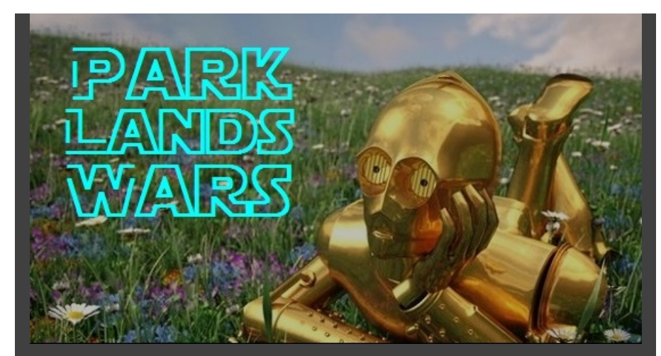
He didn't draw attention to the war that your Government has been recently waging on the Park Lands, even without the help of three new Departmental representatives on the Park Lands Authority.

He could have said much more about your Government's recent actions.