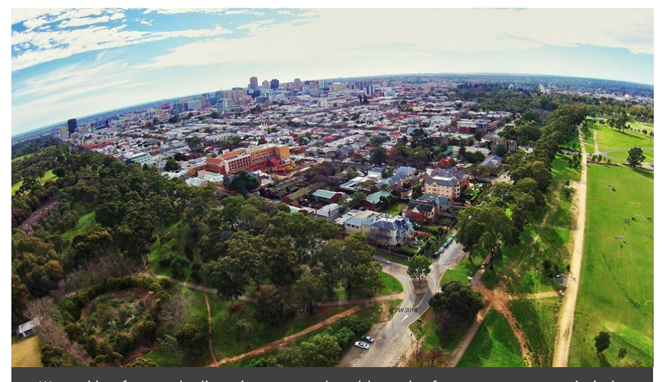
We would prefer not to be discussing seats on a board, but rather footsteps on grass – – picnics by the Torrens, revegetation, biodioversity, sporting events, gardens, and appreciation of our unique asset.

Actually, on second thought, we would prefer to be discussing the management of the Adelaide Park Lands, and what plans you might have to limit their year-on-year reduction and erosion by the State Government.