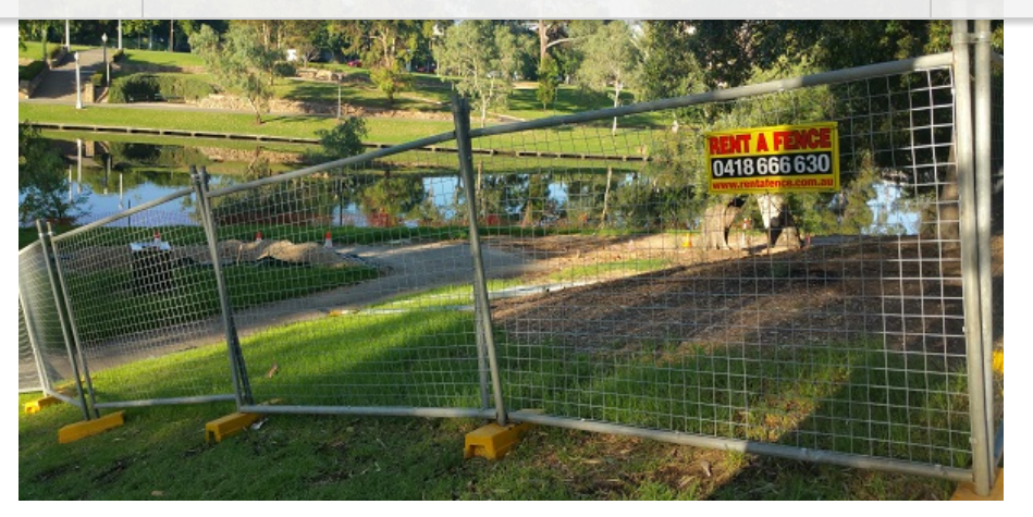
Angas Park on the Torrens Riverbank (Karrawirra, Park 12) is also off limits