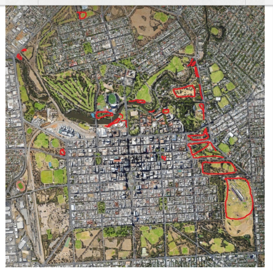
Rough guide to 'temporary' fences prohibiting (or hindering) access to Park Lands on 9 Feb 2017.