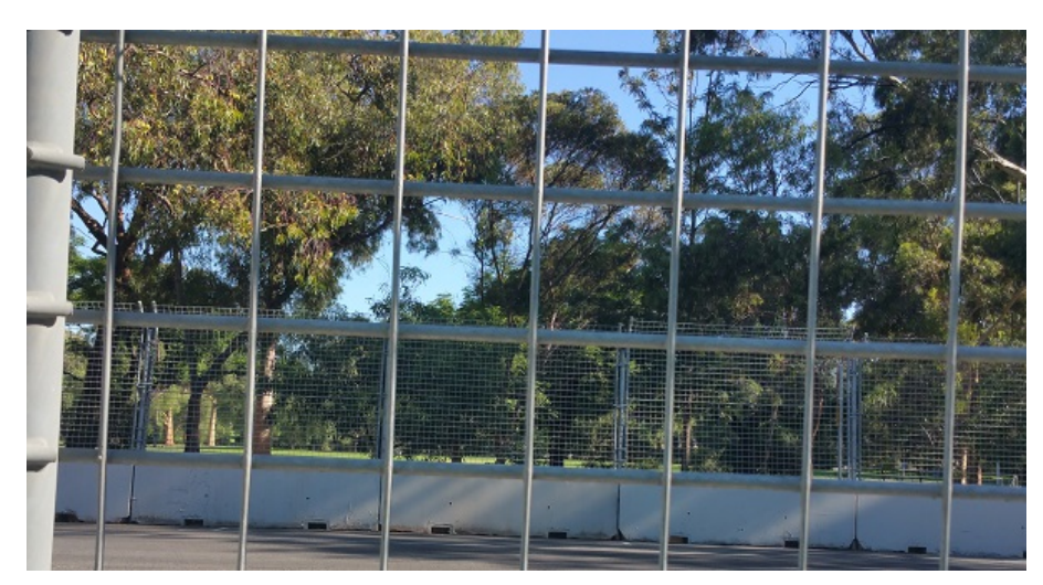
Car racing fences preventing access to Ityamai-Itpina (Park 15) off Bartels Rd