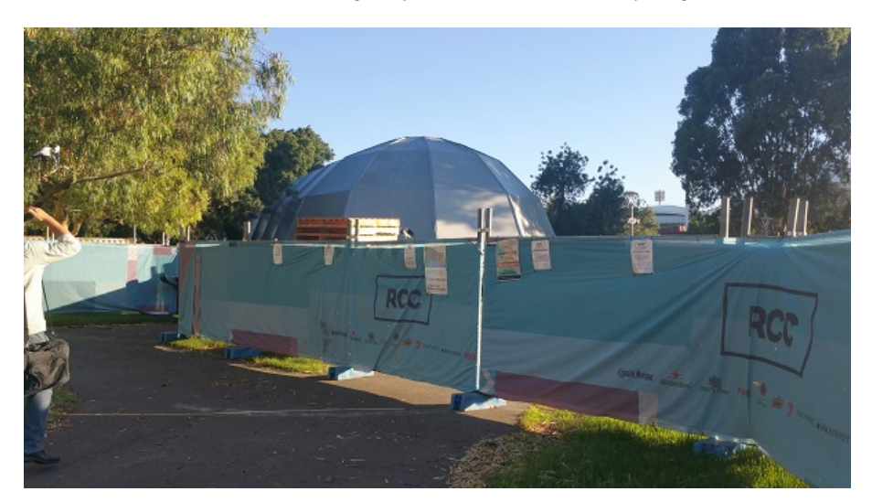
'Royal Croquet Club' taking over Pinky Flat, Torrens Riverbank, Tarntanya Wama (Park 26). The 25,000 square metre area has been licensed for 7,000 patrons, which has upset the Late Night Venue Association of SA.