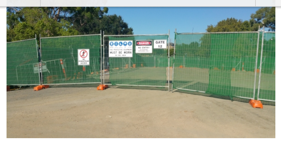
O-Bahn construction work preventing access to Rymill Park (Park 14) from East Tce