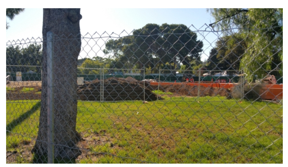
The ongoing sacrifice of Rundle Park (Park 13) to O-Bahn construction