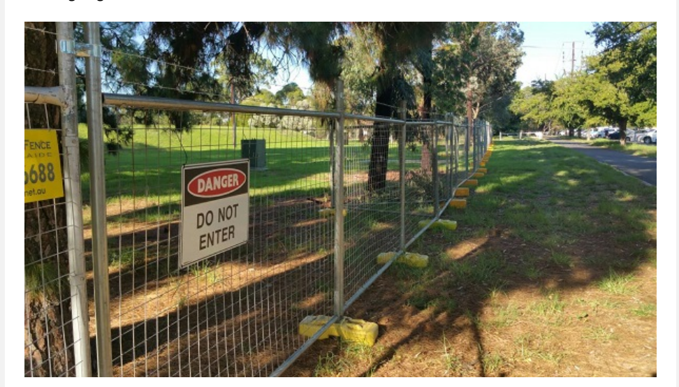
SA Water keeping you out of Kangatilla (Park 4) on the corner of O'Connell St and Barton Tce East (See the story 'Going Underground' in this e-Gazette)