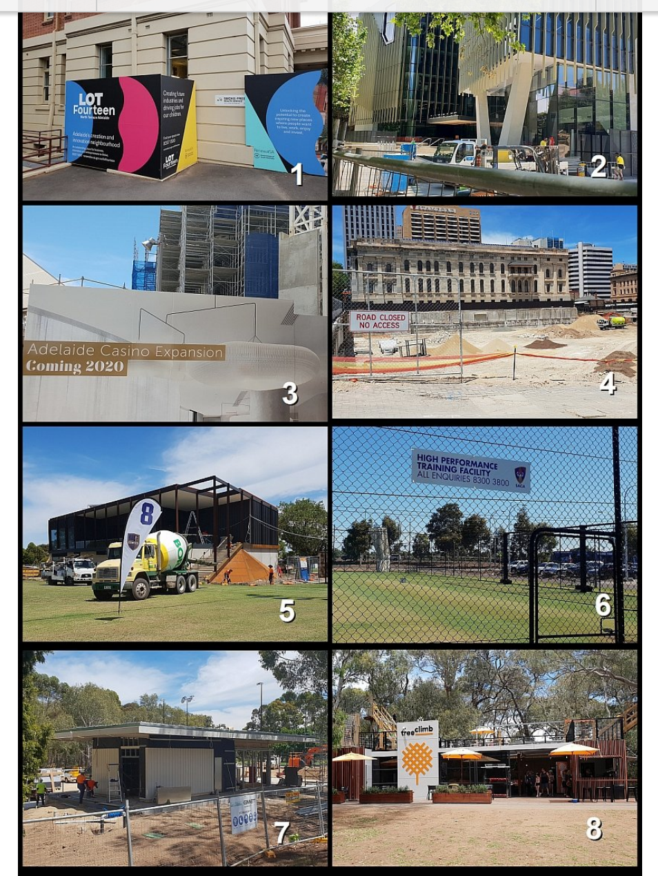
See more on each of these sites at <a href="https://www.adelaide-parklands.asn.au/2018-in-review/">www.adelaide-parklands.asn.au/2018-in-review/</a>