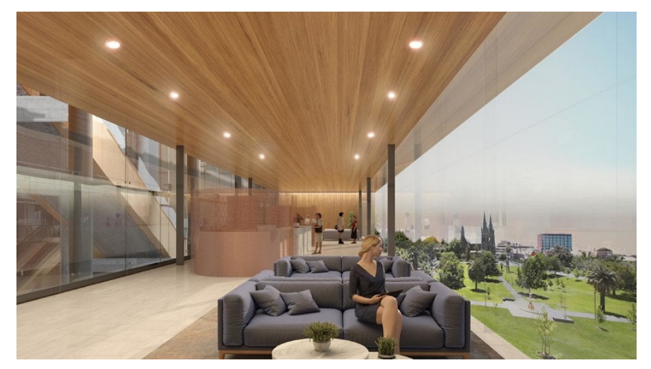
Artist's impression of the proposed hotel on the outside of the Adelaide Oval, taking over part of the paved concourse. Luxury Park Lands overview for the wealthy? Or Park Lands for the public?

If the State Government gets its way, this paved public land would disappear under a new private hotel. A $42 million dollar loan, guaranteed by taxpayers, would remove forever this area of paved public Park Lands. That's what the State Government wants.