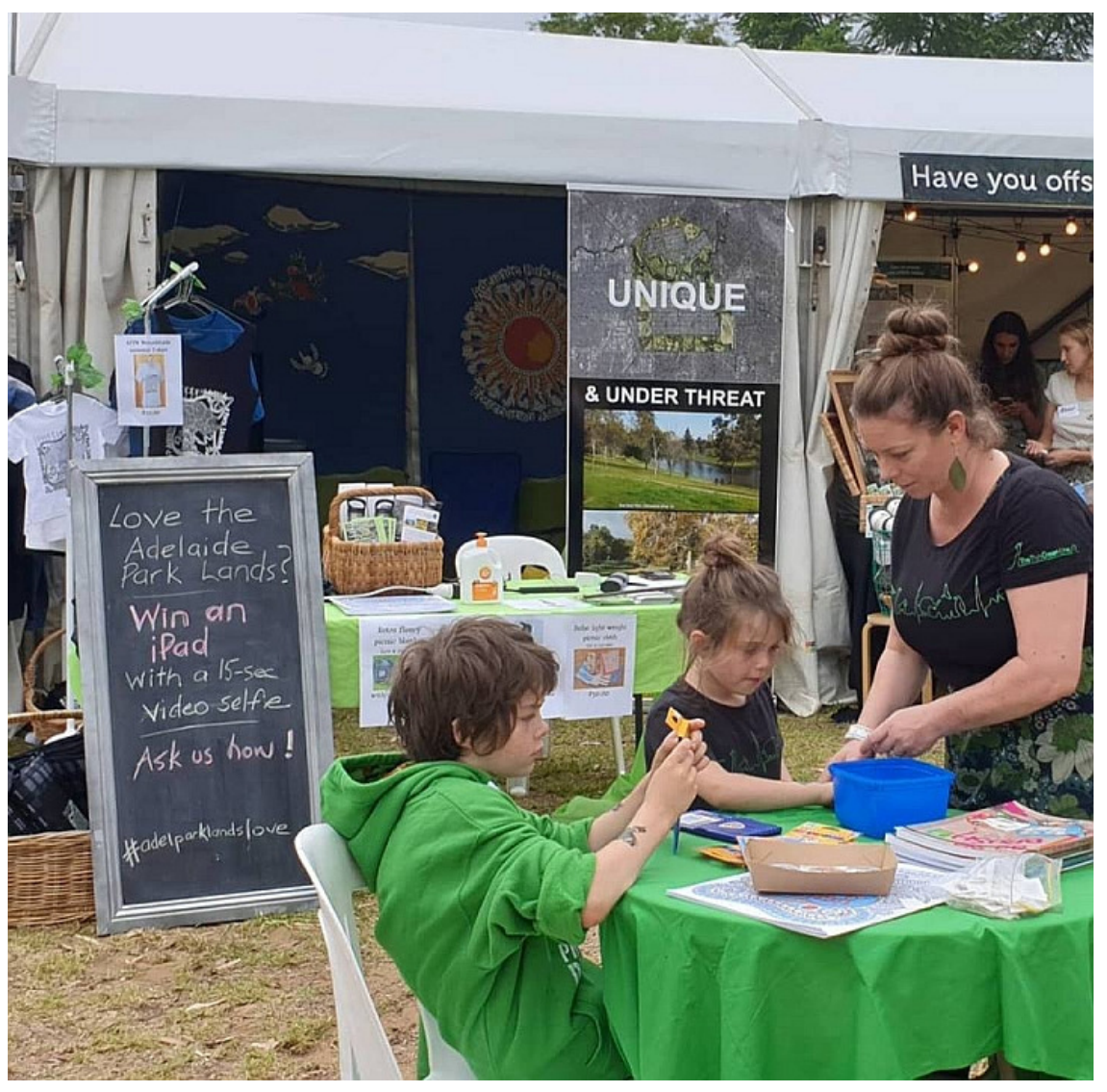
Offering temporary tattoos for kids was one way of enticing parents to find out more about the Park Lands!

guided walks, and how you can take action.