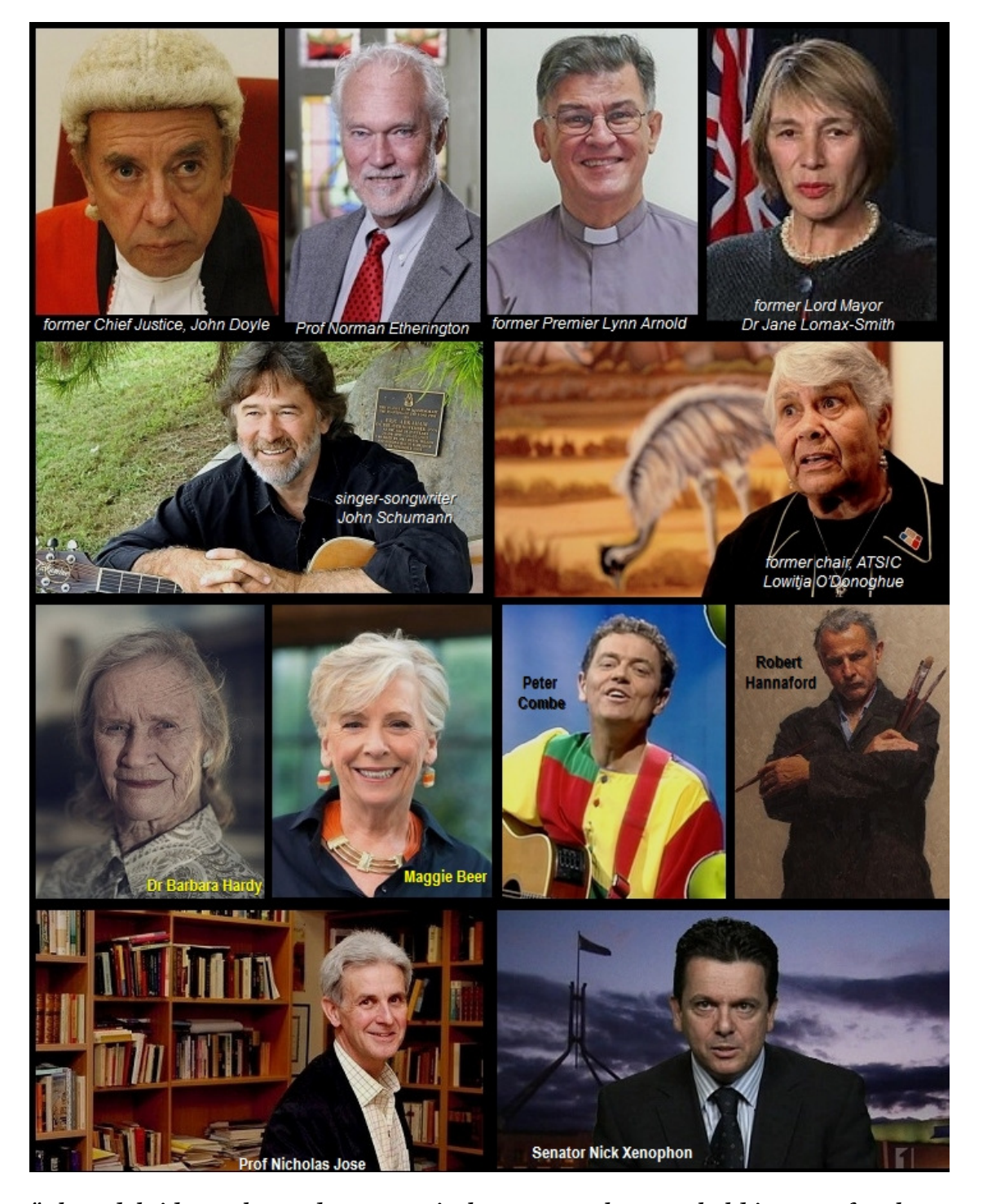
"The Adelaide Park Lands are a priceless asset. They are held in trust for the people of our City and State. They must be protected – not only for all those who enjoy them now, but for the generations to come.

"We believe that any alienation of our Park Lands for private purpose is a gross breach of that trust. Appropriation of Park Lands for commercial 'development', including hotels and office blocks, should never be countenanced, and private residential development should never be permitted. The Park Lands are an invaluable heritage that must not be traded."