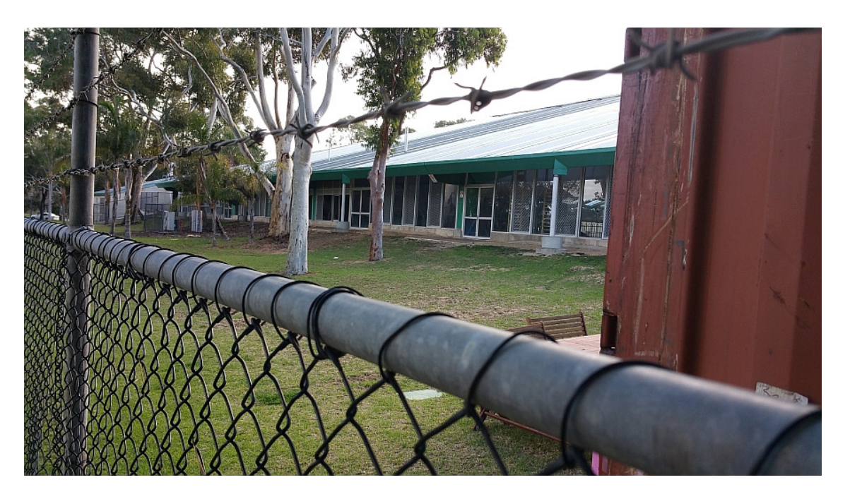
Adelaide City Council staff have been in discussions with management of the Adelaide Crows about the possibility of the AFL club taking over this site in Denise Norton Park / Pardipardinyilla (Park 2) (Subscriber-only link to 'Adelaide Now' story of 1st March)

It's early days, and nothing has been agreed or decided upon, but the Aquatic Centre is well known to be a drain on the City Council's finances. Although it's well-loved by swimmers throughout Adelaide, it loses $700,000 per year. What's more it requires major refurbishment or repairs. Options include spending $3 million to $5 million on short-term repairs or between $10 million to $15 million for a major overhaul. (Subscriber-only link to 'Adelaide Now' story of 11th March)