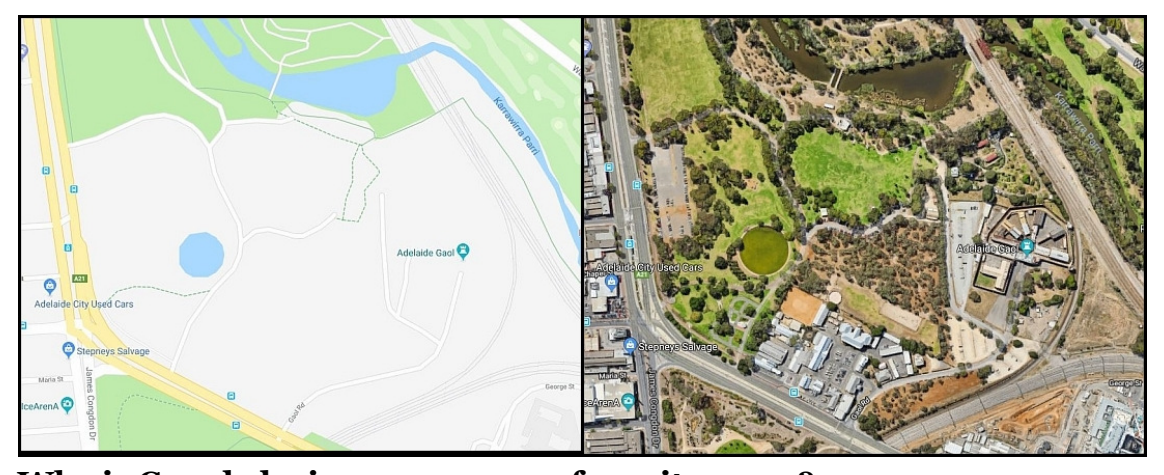
Why is Google losing green space from its maps?

The Adelaide Park Lands Authority next week will consider the final version of a new master plan for Whitmore Square / Iparrityi. The plan includes (as a first step) improved lighting to the diagonal path from Sturt Street west to Wright Street east. This path is a popular route for pedestrians walking to/from the Market District, and was one of the top issues raised in recent community engagement. The work is expected to be completed by June. Click the pic for details.