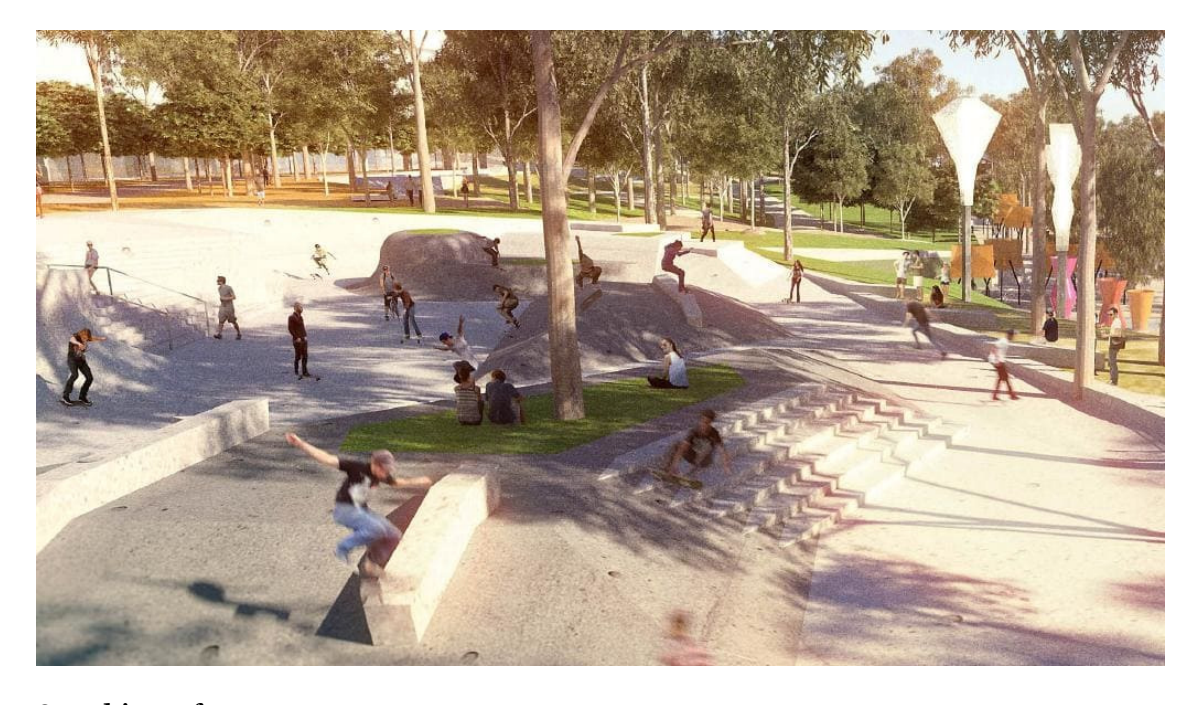
Speaking of concrete.....

Various artists' impressions for one or more stadiums (stadia?) near the corner of War Memorial Drive and Montefiore Rd. The suits are doing their homework now to ensure that at least one version of these gets built.