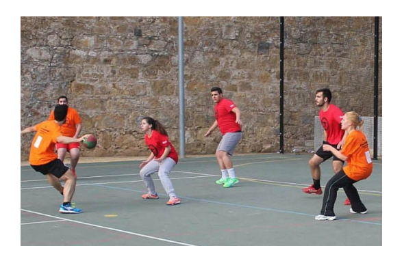
Come and Try Street Handball - Sunday 17 March 5-7pm in Mary Lee Park

Guided walk through Blue Gum Park / Kurangga (Park 20) Sunday 17 March 10am to 11.30am. This Park is known as Adelaide's playground, with facilities for a multitude of sport, and hosts both Adelaide's oldest playground (1918) and the city's newest (2018). The South Park Lands Creek winds its way across stunning tree-lined footpath avenues. Children and dogs on leads most welcome. Gold coin donation requested (free for APPA members) Click the pic for details.