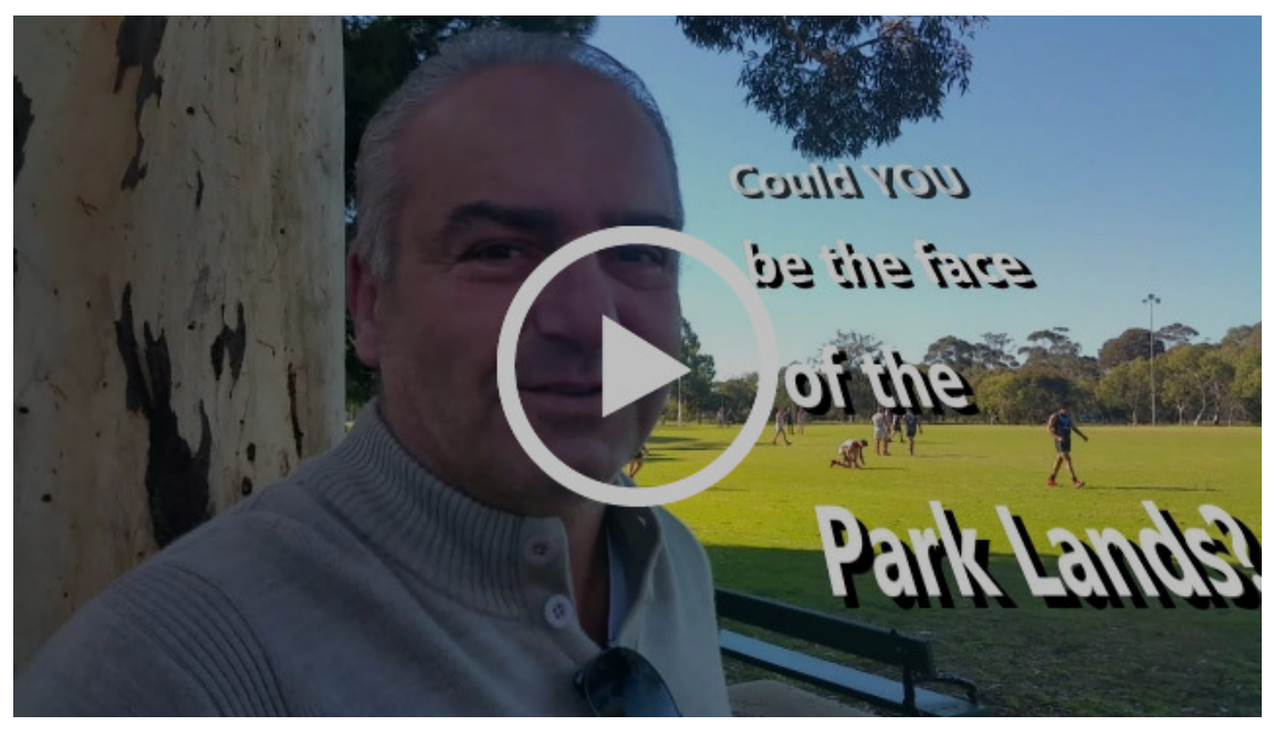
Don't delay - closing date: Friday 29 March 2019

There are always events scheduled in the Park Lands, many of them free, and there are always opportunities to explore the Park Lands on your own, or with friends or family. Browse our 'Explore Parks' pages for hints about interesting spots to visit. This month's featured opportunities, in date order, are: