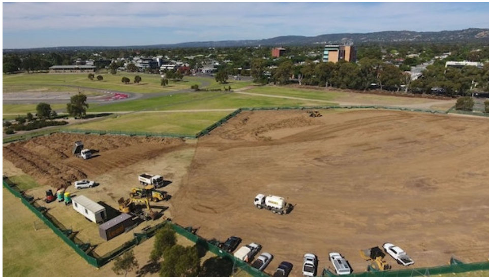
Last month, the first stage of the project was carried out - removing a grove of white poplar trees (characterised as "woody weeds") to clear the location for the new wetlands.