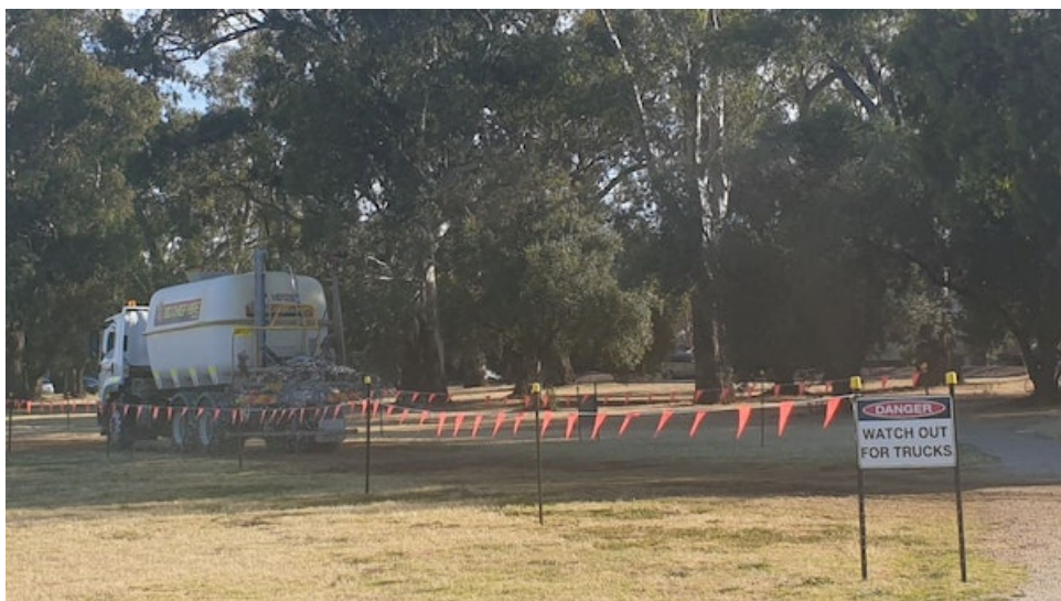
Soil is being spread, temporarily, over a wide area in the eastern centre region of Victoria Park, off Fullarton Road (opposite Grant Avenue)