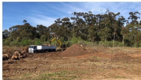
However the small depression that's been left is just the beginning of the major works.