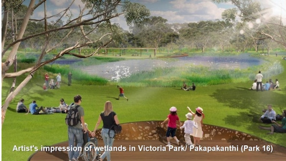
Artist's impression of wetlands in Victoria Park/ Pakapakanthi (Park 16)

The project is also intended to improve safety and biodiversity along the South Park Lands creek, and create a scenic haven to attract visitors to the southern part of Victoria Park.