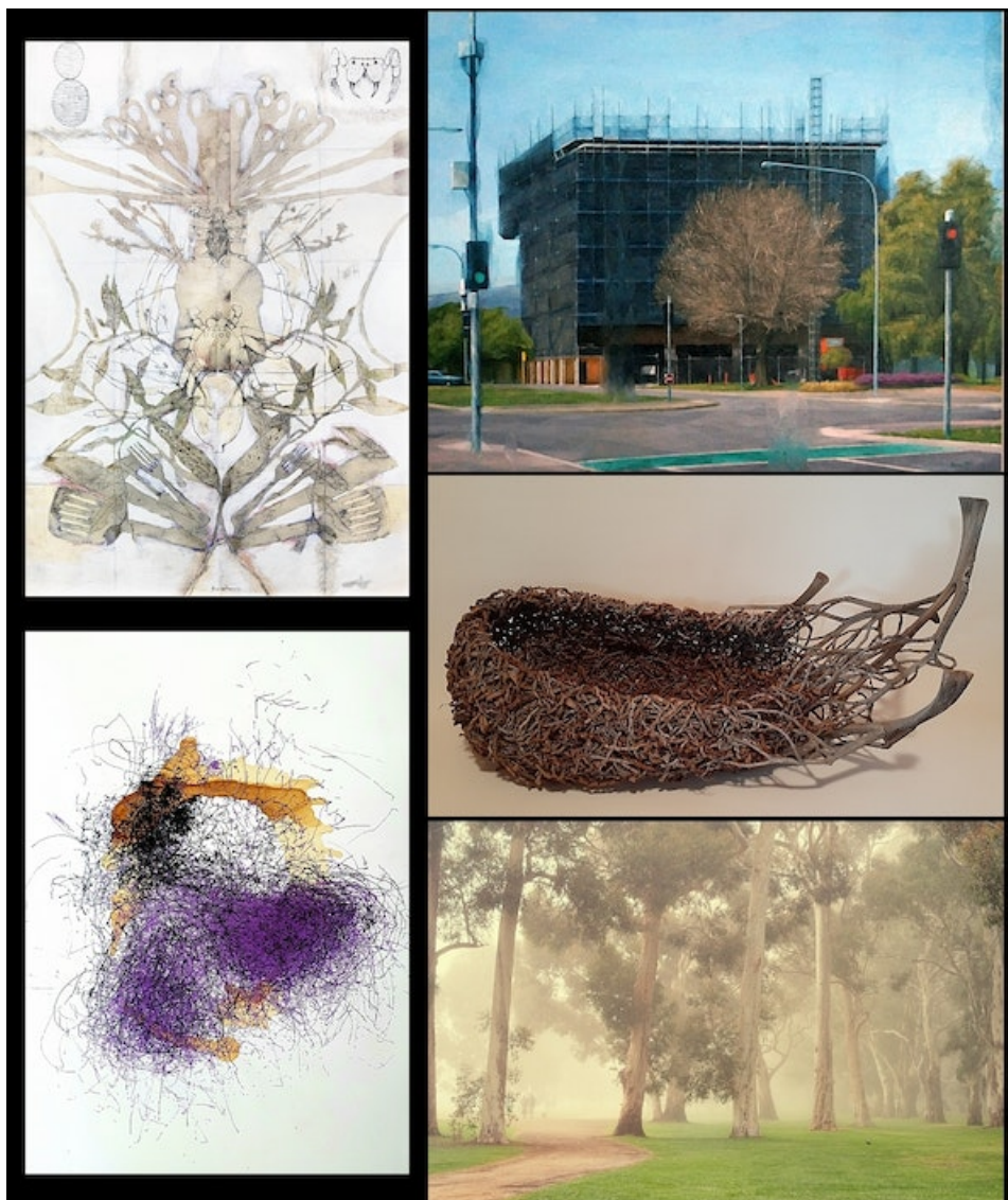
Pictured above: five of the finalists. Clockwise from top left: