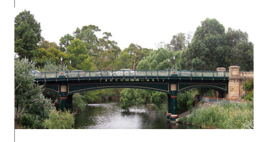
The Albert Bridge

1. Today's Hackney Bridges are on the site of an earlier bridge called Prescott's Crossing constructed to give farmers access from North of the river to the South Australian Company's mill which occupied the current site of the Hackney Hotel. Prescott's Crossing was washed away in the great flood of 1851. A replacement named the Second Company Bridge was built in 1860 and was in turn replaced by the current bridge in 1885. This bridge is characterised by stone abutments, steel arch and a replacement deck of concrete that was installed circa 1950. A parallel bridge adjacent and on the downstream side has since been constructed of composite steel girder and concrete.