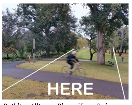
Building Alliances

The battle for Rymill Park is not over. The Government's current plans still involve digging a massive trench through Rundle Park and Rymill Park (with the trench uncovered in the pictured area