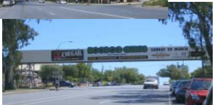
Wakefield Road, January 2005.