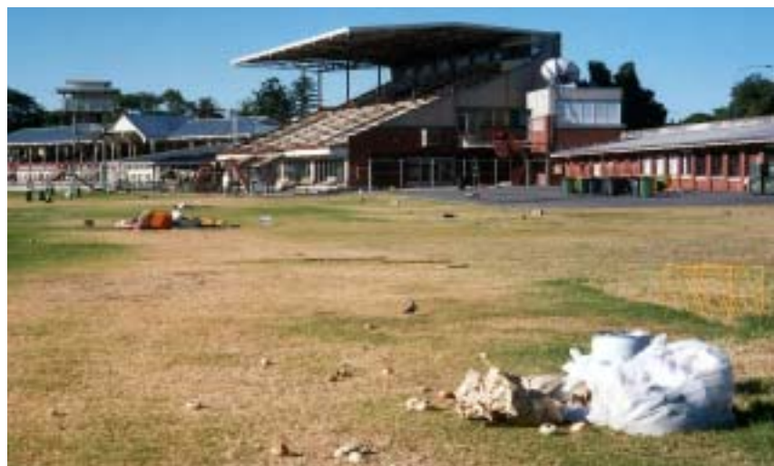
Victoria Park on Boxing Day Holiday 2004, 10 days after the last racing fixture run by the SAJC.

Option 3 does not offer anything new—it is basically the same proposal as was thrust at the public during consultation. It merely omits mentioning the realignment of the V8 car race track to run along the front of the Heritage Grandstand.