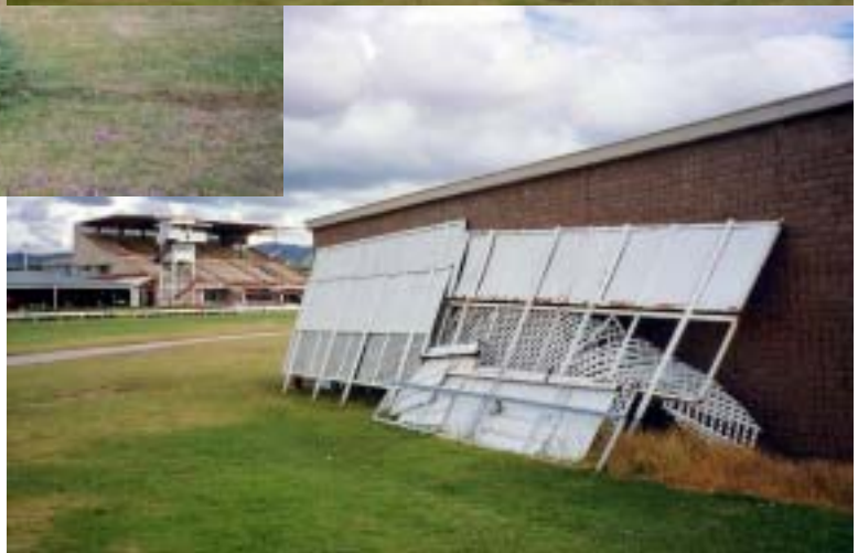
Above: Rollers left to rust for years at Victoria Park.