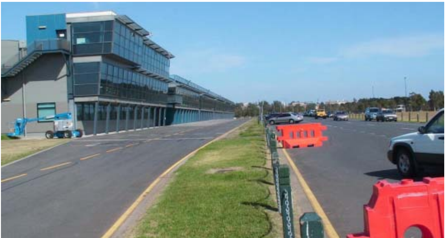
This three-storey permanent structure with expansive bitumen surrounds now 'graces' Albert Park Reserve, Melbourne because of the annual F1 race. The Adelaide multi-storey, multi-function proposal is similar, if not larger, in size.