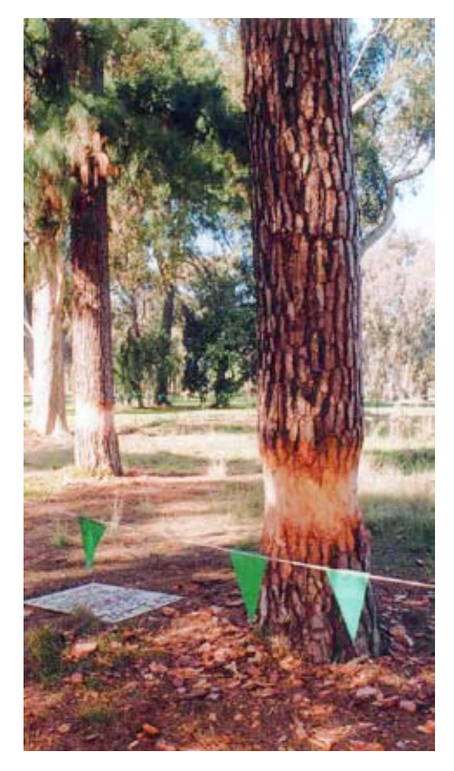
Above: The Canary Island pine on the right still survives. The one on the left was chopped down in May 2008. Photo taken by Gunta Groves, 5 June 2004.