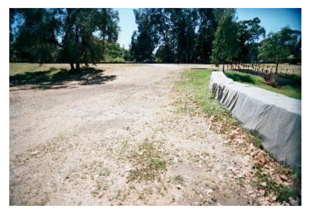
Above: New road created by transports accessing the GUD site from Botanic Road. This is normally grassed.

If minded to let the area to the GUD as a cover for an alcoholic fast food sideshow alley rather that artistic festival performances, the ACC should embark on true cost recovery and protection of the area concerned. The public accepts a wide range of temporary use and alienation of Park Land areas for legitimate reasons. However, when members of the public complain, they do not deserve to be told that the price