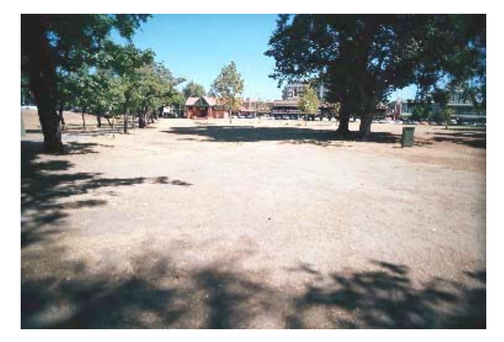
Above: Rundle Park in the eastern Park Lands looking towards the public toilets and East Terrace. This is part of the Garden of Unearthly Delights site occupied for six weeks, including set-up and pull-down. Photo taken by the author in April 2008 after most of the infrastructure was removed.

The apparent incompetence of the ACC is masked in soothing words that 'the event is popular'. Of course, the event is popular for reasons other than artistic display and merit. The ACC argument is nonsense. One would have no doubt that mud wrestling would be equally as popular if accompanied with the appropriate alcoholic lubricants. Apparently no-one in the ACC with the power to make decisions can be bothered to actually look at the reason for local residents' anger and complaints at the