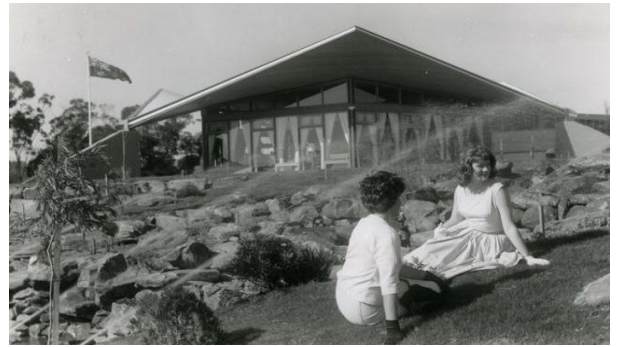
Est. 1963 as the "Alpine Restaurant"