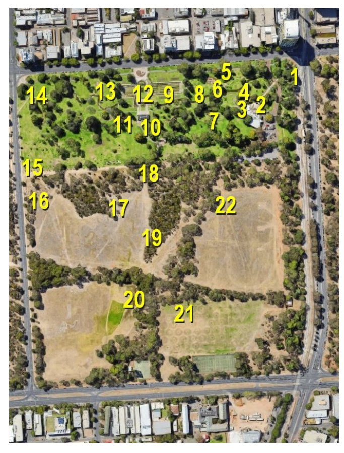
2. "The Pavilion"

Named after former Town Clerk William Veale. Veale Gardens is just the northern one-third of the Park. The Kaurna name means the location of the edible "Walyu" root.