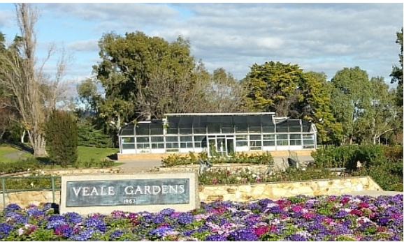
Erected in the 1960s. Demolished in 2016.