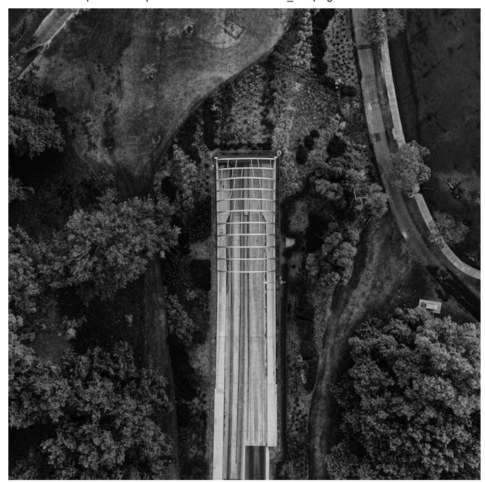
Looking ahead to the next Park Lands Art Prize in 2023, we expect to be calling for entries in late 2022. To keep in touch follow the <u>Park Lands Art Prize on Facebook</u>, and/or <u>subscribe to email updates.</u>