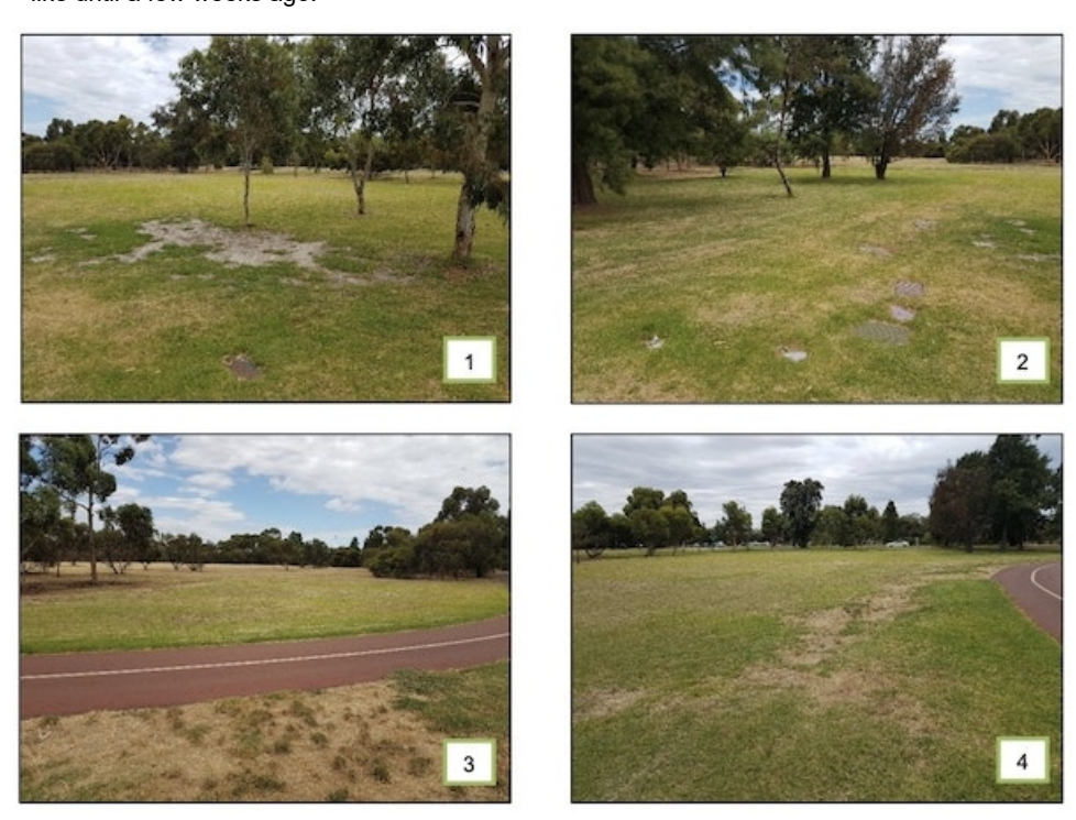
This area of about 3,000 square metres is about to be planted with more than 500 local native tube-stock seedlings from the Mallee Box Woodland ecological community.

For most of the 20th century, this site was home to the "Fitzroy Croquet Club". Since 2004 it's been an area of irrigated Kikuyu and Couch grass without any trees. Here's what it looked like until a few weeks ago: