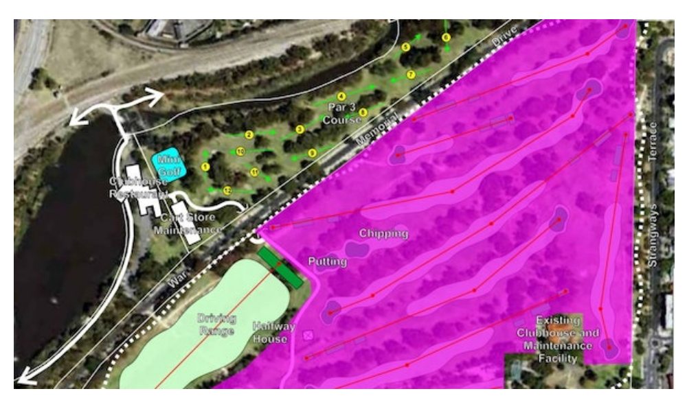
In 2018, the City Council "deferred" the matter pending "consultation with the Kaurna community" but it's understood no such consultation has been undertaken.

Surprisingly this recommendation was made without any reference to the Council's own Reconciliation Committee nor the Kaurna community.