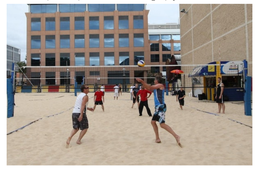
The council-owned City Beach volleyball courts in Pirie Street (above) are being sold and the Council asked the Park Lands Authority to consider including beach volleyball in the plans for the Port Rd site.

This (below) is the "in-principle" layout that has been endorsed by the Park Lands Authority.