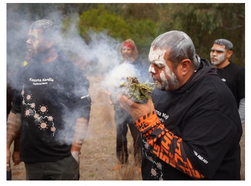
Read more here.

Local Kaurna people held the first "cultural burn" in an Australian capital city for two centuries. Traditional owners say it provides for healing and reconciliation between different cultures and the land itself.