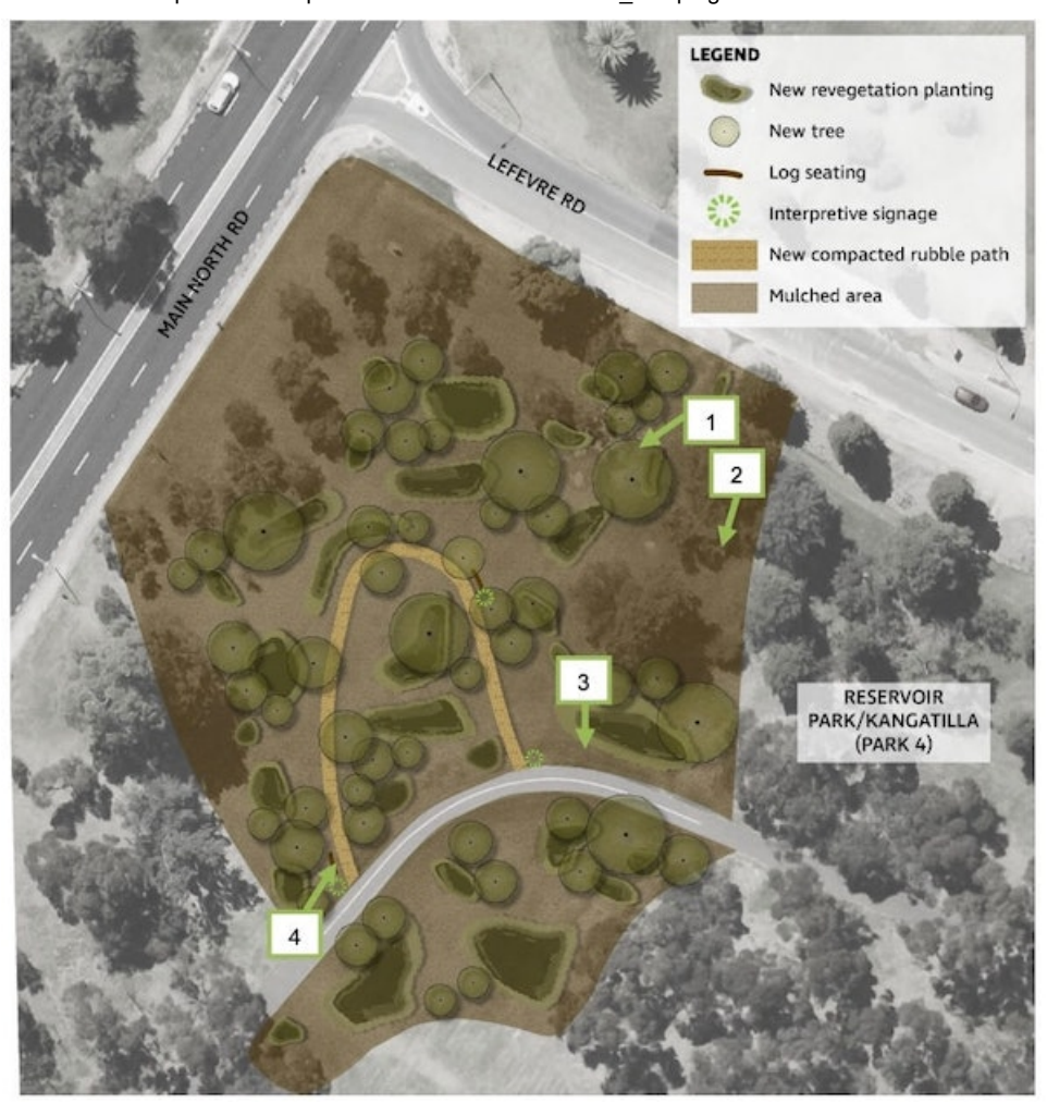
This is described as a "Biodiverse Carbon Offset Planting demonstration project".

For most of the 20th century, this site was home to the "Fitzroy Croquet Club". Since 2004 it's been an area of irrigated Kikuyu and Couch grass without any trees. Here's what it looked like until a few weeks ago: