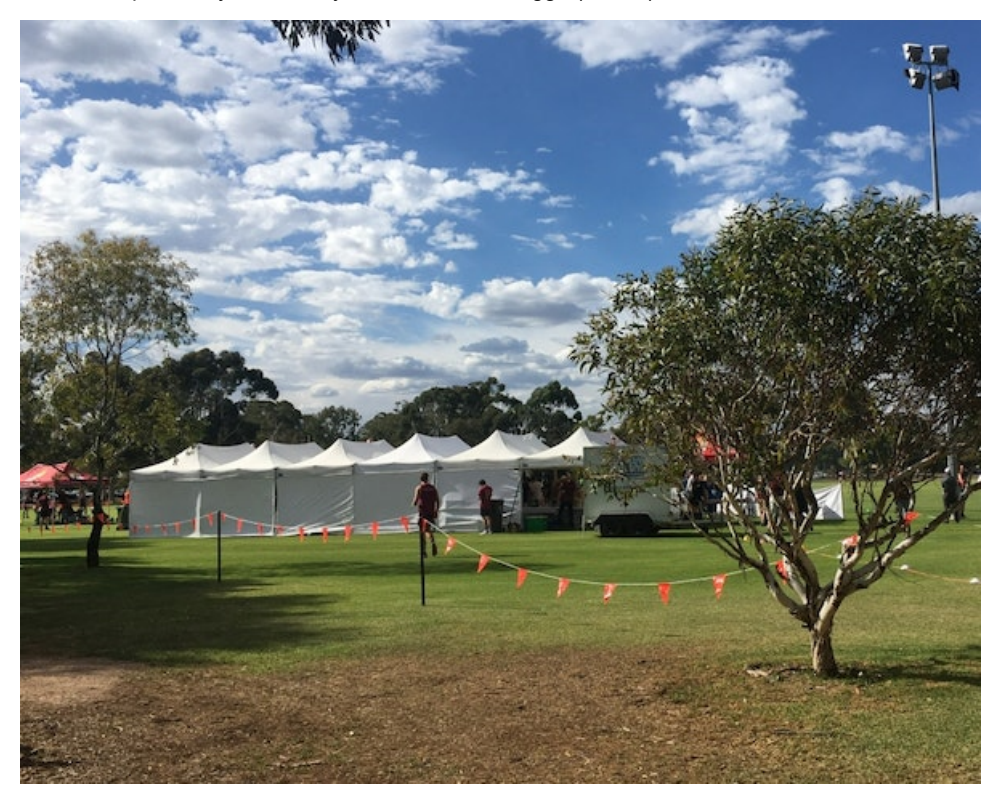
On Saturday 1 May, PAOC set up this marquee to indicate the approximate size and location of what they want to build in Park 9. Read more <a href="here.">here.</a>

Prince Alfred College Old Collegians (PACOC) are awaiting a decision from the City Council on whether to approve construction of proposed new "club rooms" including a bar and a function space on your Bundey's Paddock / Tidlangga (Park 9)