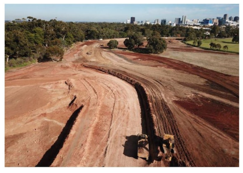
To assist in the management of water within the wetland, a network of drainage pipes and pits are being installed, with about 75% of these works completed.

The soil is being stockpiled nearby in the Park and will be returned to the area of the wetlands later this year to support the growth of more than 100,000 new plants.