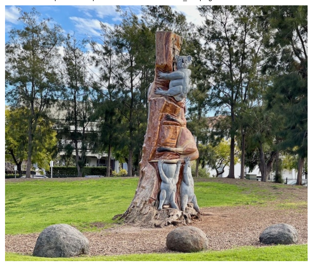
Read more >>>