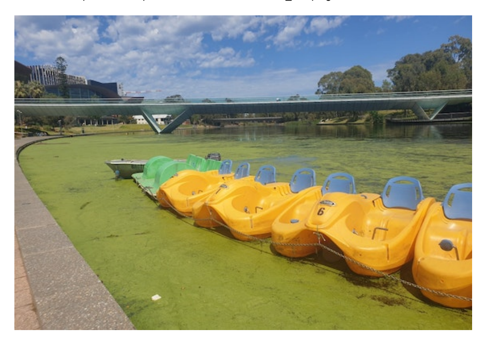
Read more >>>>