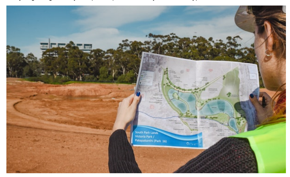
Read more in Clty Mag >>>>