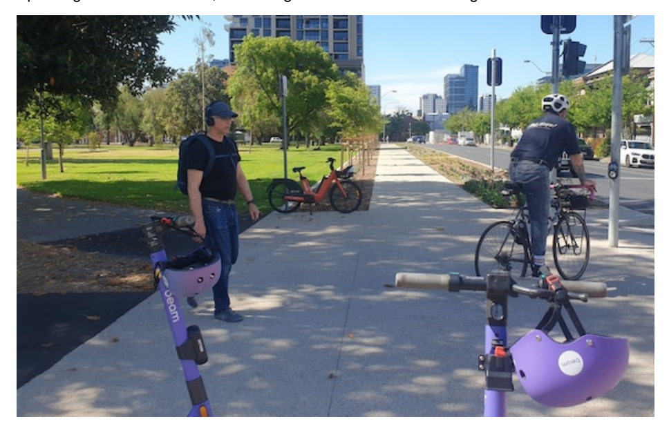
Read more >>>

Improvements include a new footpath around much of the square's perimeter, the planting of deciduous trees, and new garden beds around the edge.