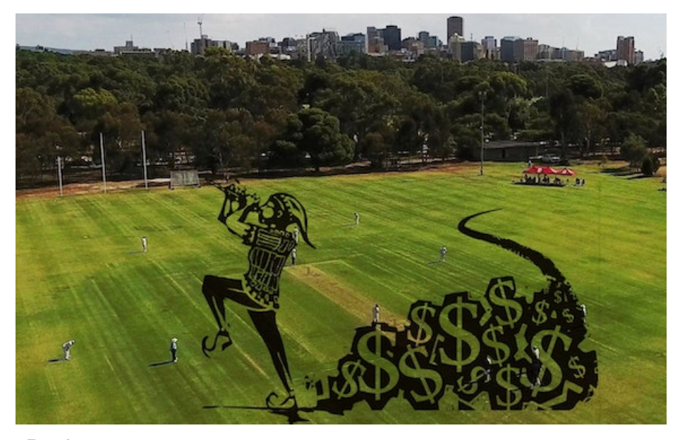
Read more >>>

Funds provided for Greening Adelaide grants and other Park enhancements are vastly exceeded by funds provided to destroy hundreds of trees and huge tracts of your Open Green Public Park Lands.