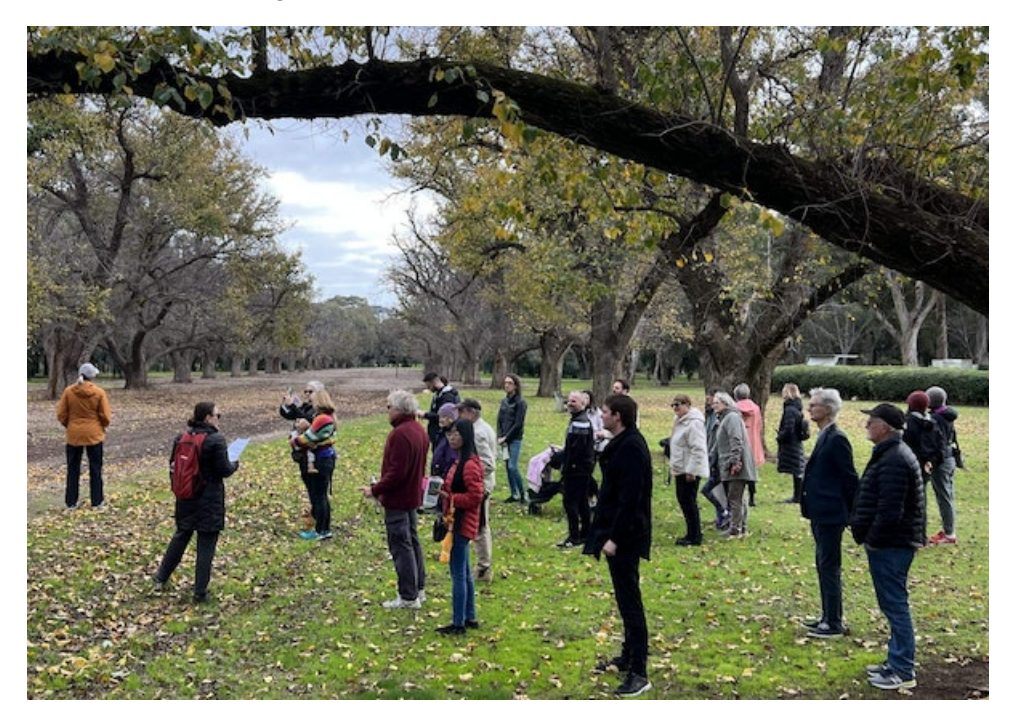
Take the Virtual Trail here >>>>

If you missed the occasion, you can catch up at any time, and guide yourself through this cherished, well-wooded south-east corner of your Park Lands with our brand new Trail Guide.