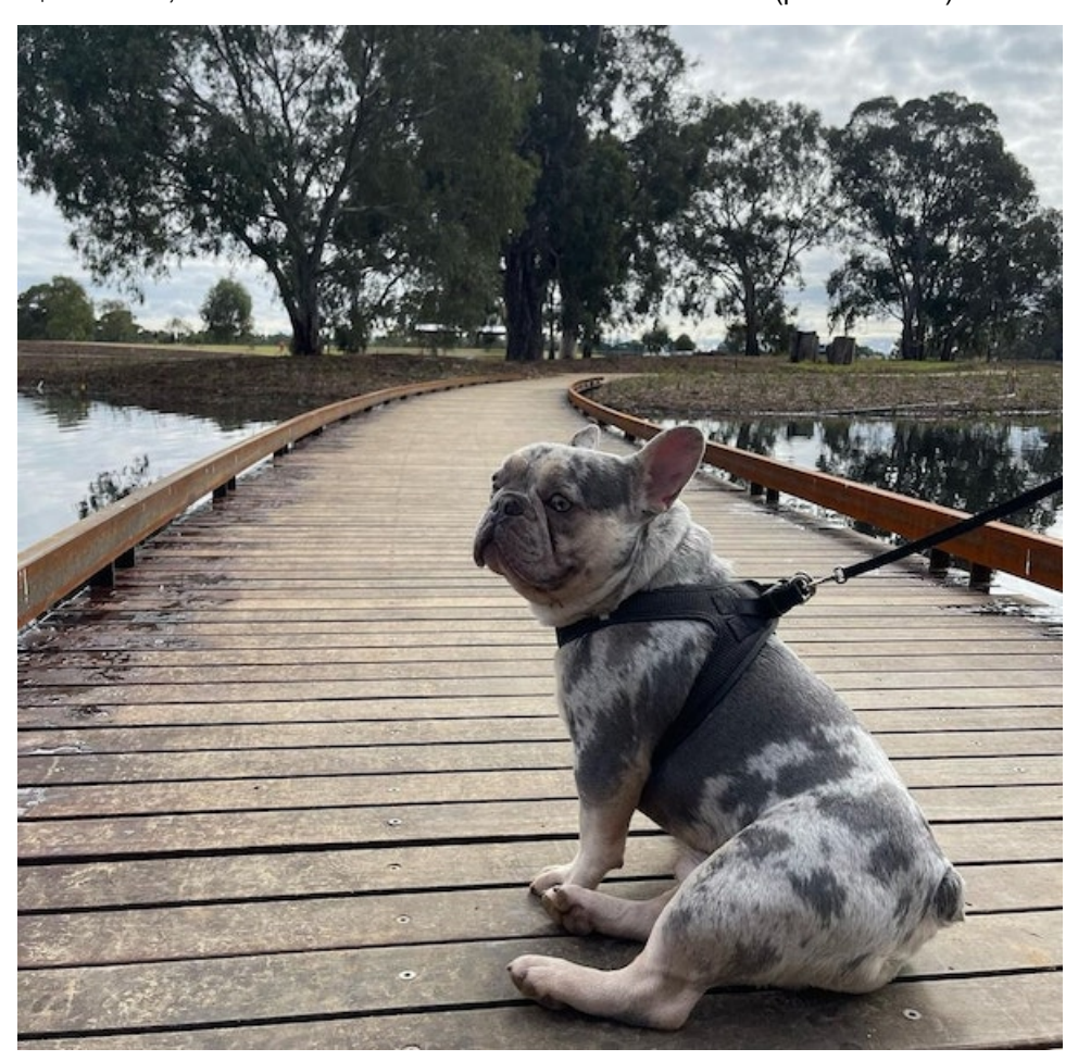
Read more >>>>

However, some think it's a bit 'ruff' that canines are allowed to roam free in the $13 million, 3.2ha wetlands. It's been a bone of contention (pun intended).