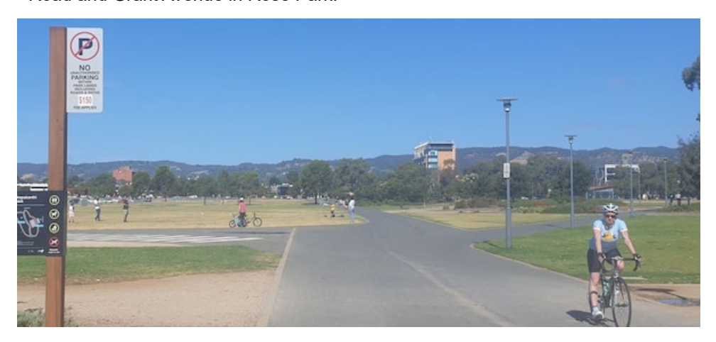
Read more >>>>

The plantings would provide much-needed shade around the Park's playing fields and beside the "green corridor" that connects Halifax Street in the city to Fullarton Road and Grant Avenue in Rose Park.