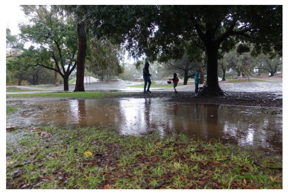
Read more >>>>

Elsewhere, the new $13 million, 3.2ha wetlands in Victoria Park / Pakapakanthi (Park 16) were put to the test.