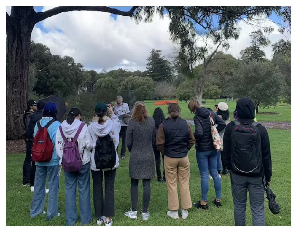
Read more >>>