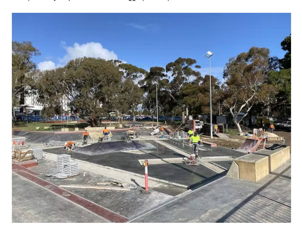
Read more about construction progress here: <a href="https://yoursay.cityofadelaide.com.au/city-skatepark">https://yoursay.cityofadelaide.com.au/city-skatepark</a>

Contractors are putting the finishing touches to the facility off West Terrace (opposite Hindley Street) in Gladys Elphick Park / Narnungga (Park 25).