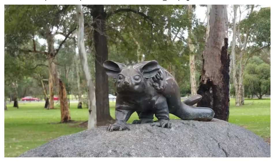
Read more >>>