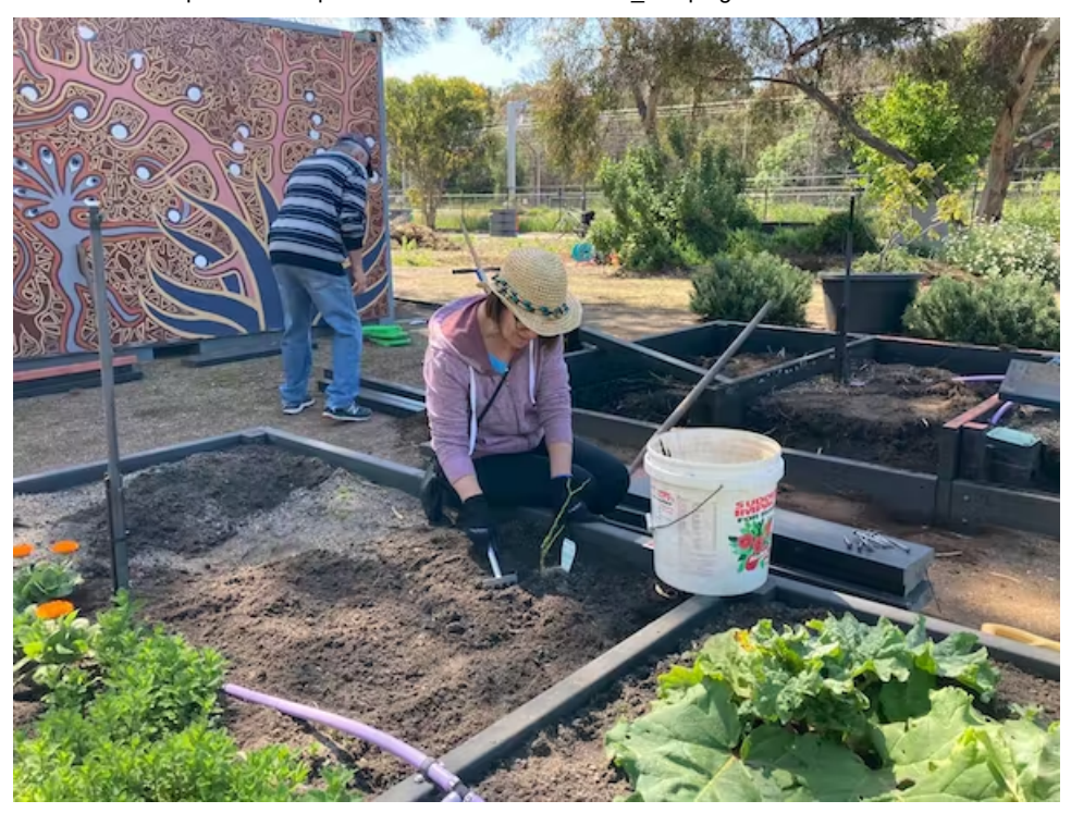
Read more >>>>