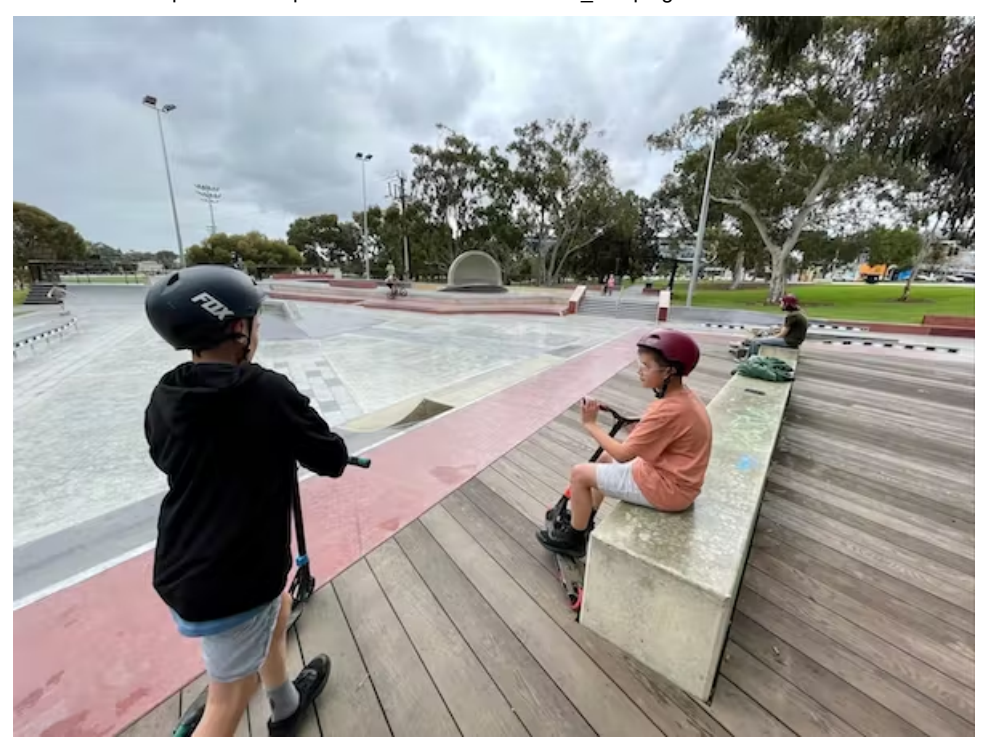
Read more >>>>