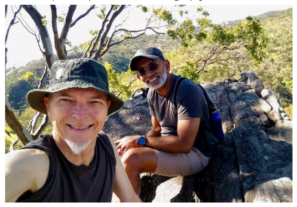
Read more >>>