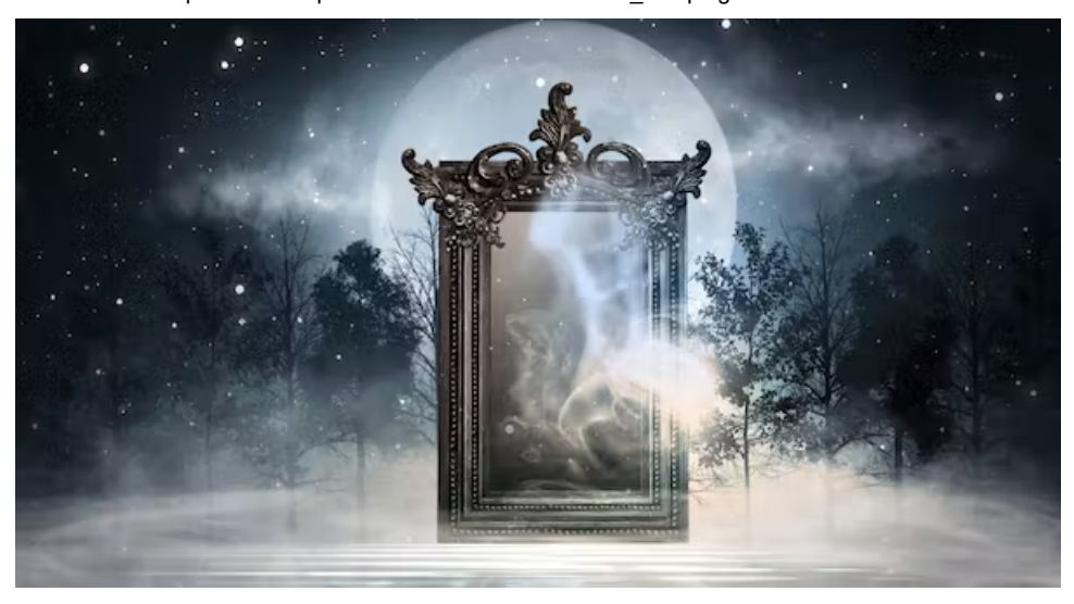
Read more >>>