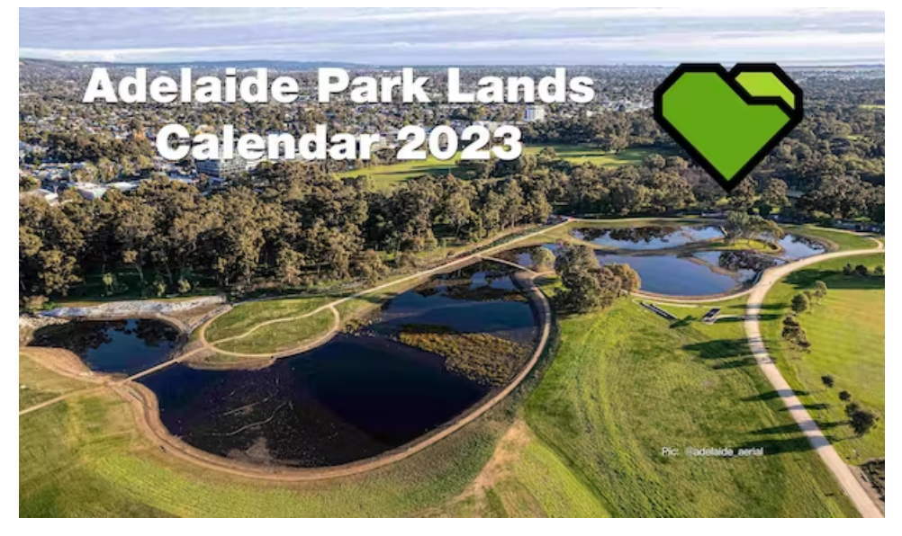
Our 2023 wall calendar - among the items in the APA Shop.