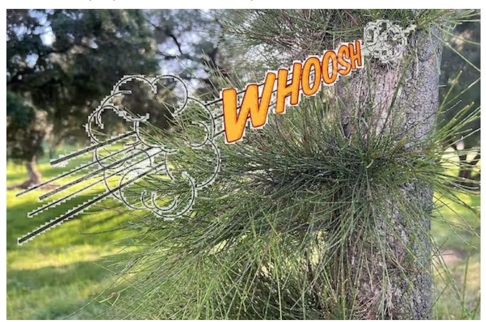
Read more >>>

This new law gives two State Government Ministers unfettered powers to confiscate any of your Park Lands that they want.