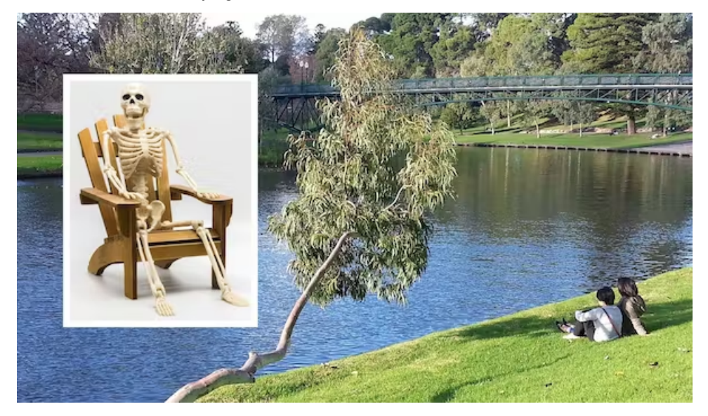
Read more >>>

More than four years after a State Heritage Council recommendation, the State Government is still relying on the same tired excuses for its failure to act.