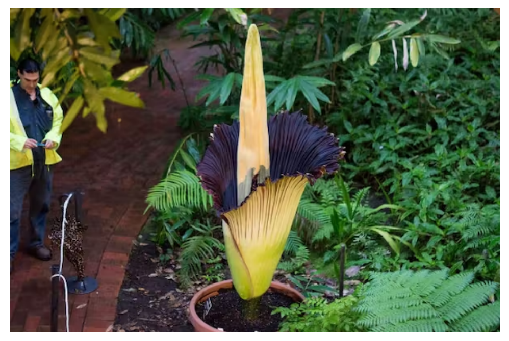
Read more >>>

This didn't stop park lovers queuing in their hundreds a few days ago, to see and smell the so-called "corpse flower" during its brief flowering at the Adelaide Botanic Garden (Park 11).