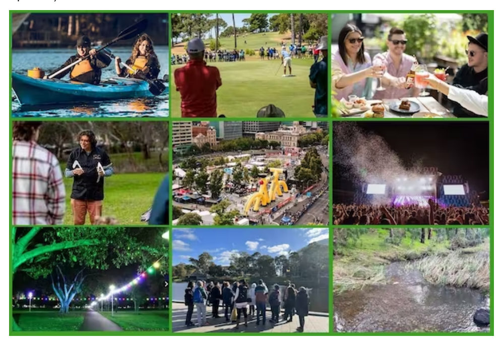
Read more >>>>

(This is a repeat of the story from our newsletter of 1 January, so some of these events have passed)