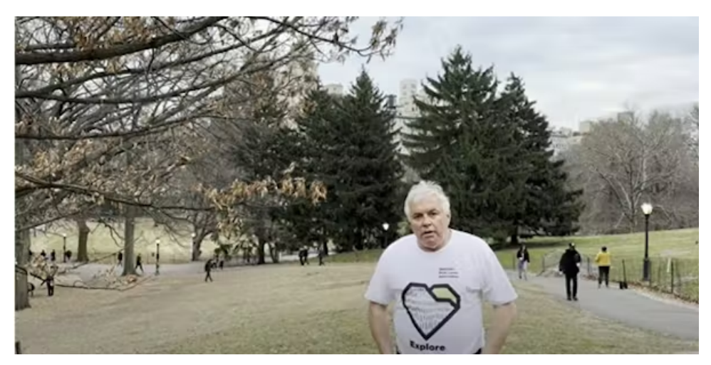
Watch here >>>> YouTube video, 1m 21s

What will it take to persuade the SA Government to Love Your Park Lands like New Yorkers love their Central Park?