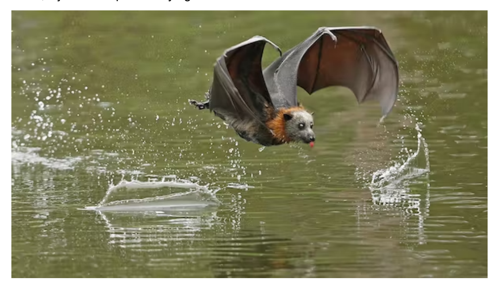
Read more >>>>

Fortunately there is a team of about 40 volunteers who look after, rescue or foster sick, injured or orphaned flying foxes and microbats around Adelaide.