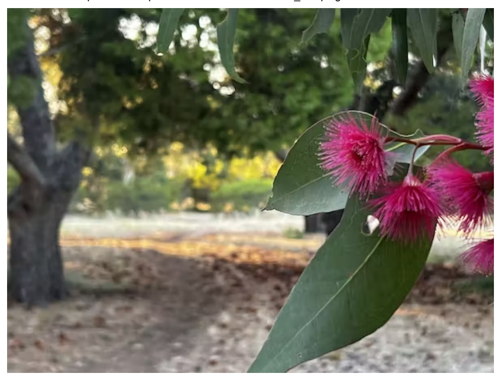
Read more >>>