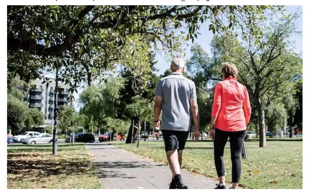
Read more >>>>