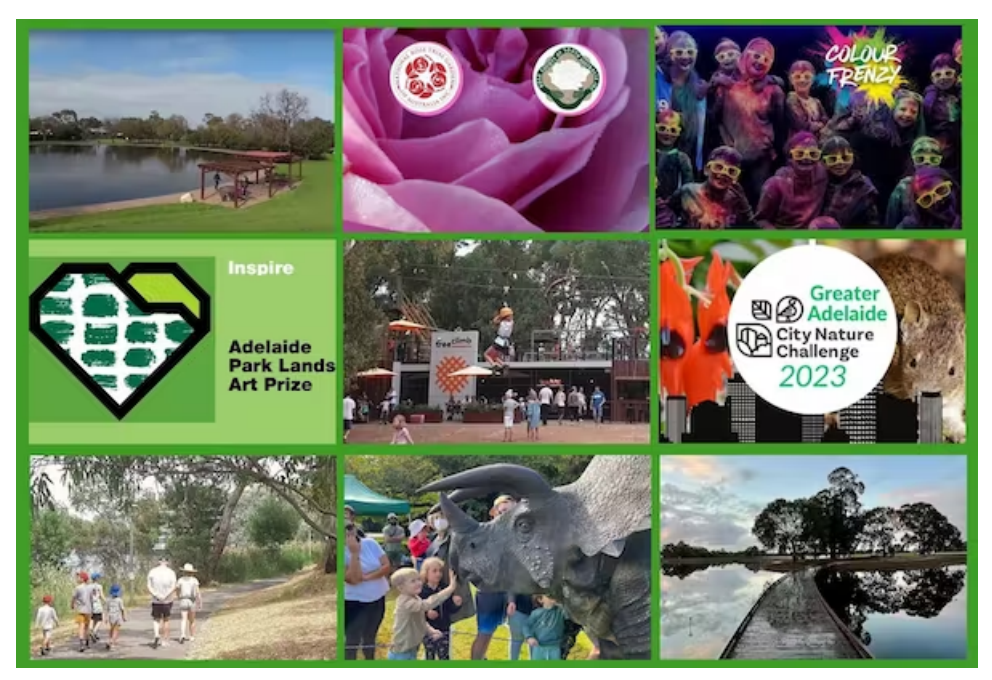
Read more >>>>

Some of them will require early booking, so don't wait!