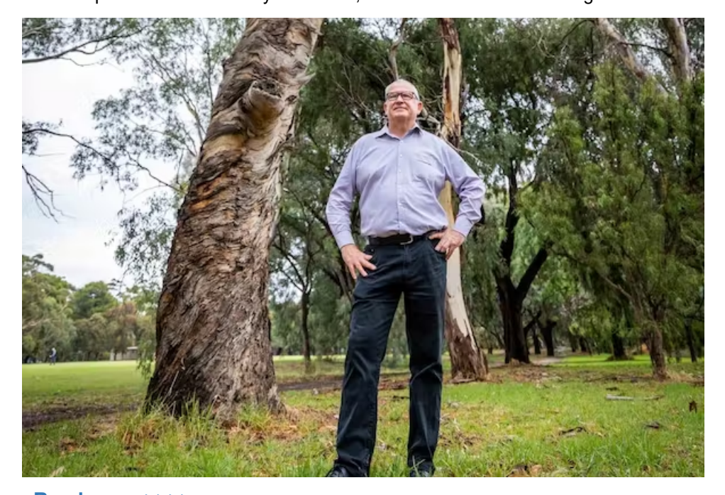
Read more >>>>

These questions are not easy to answer; but we do have some strong clues.