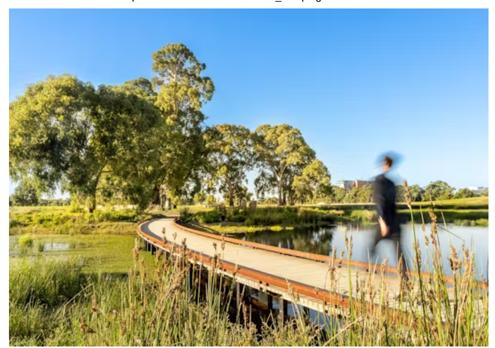
Read more at AILA >>>