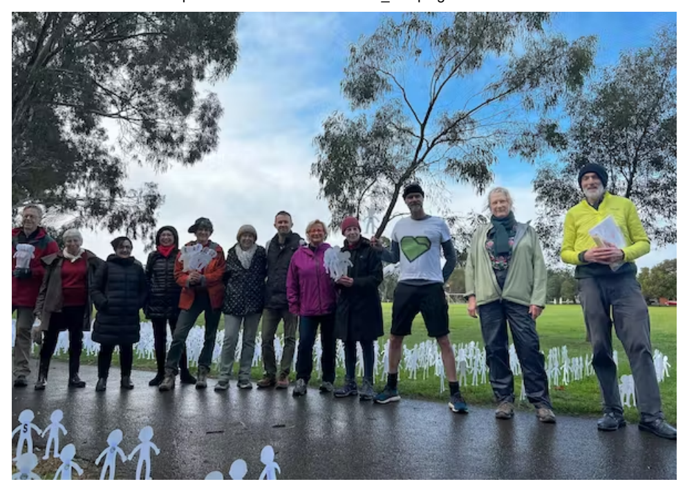
Read more >>>