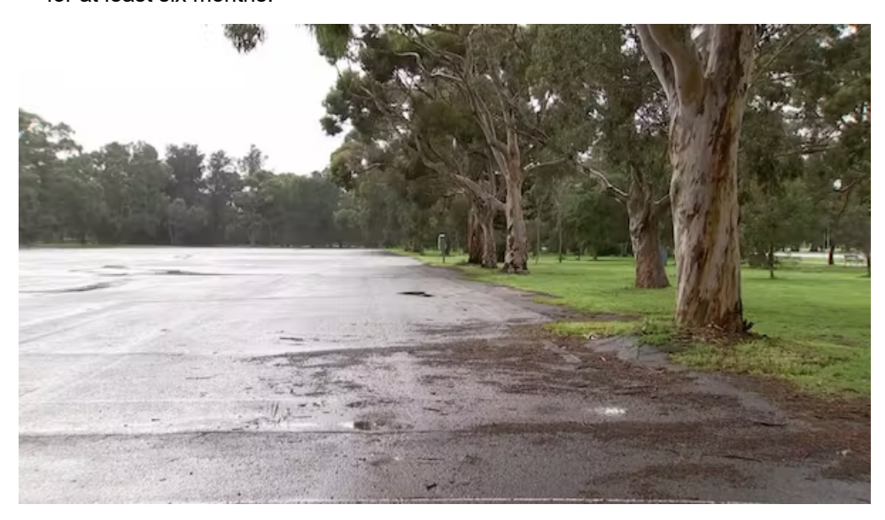
Read more at ABC news >>>>

The decision allocates a part of 'Edwards Park' - i.e. the former netball courts off Anzac Highway in the southern part of G.S. Kingston Park / Wirrarninthi (Park 23) - for at least six months.