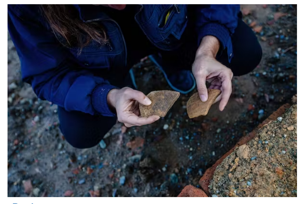
Read more >>>

There are stories to be told about these fragments of clay pottery, chinaware, and locally-made bricks.