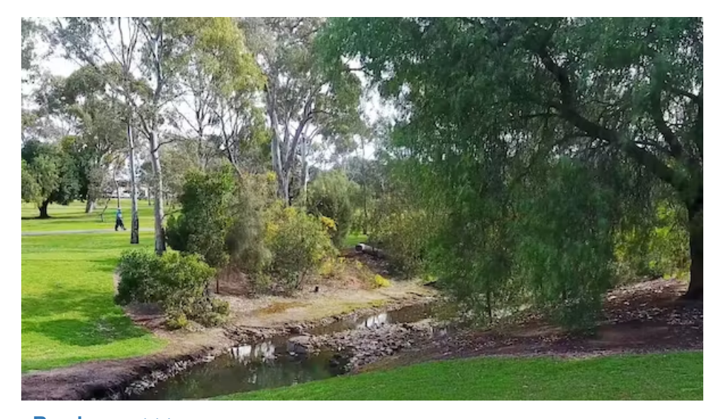
Read more >>>

The three-year upgrade will include a focus on biodiversity, creating new habitat and natural spaces, while acknowledging Kaurna cultural connections.