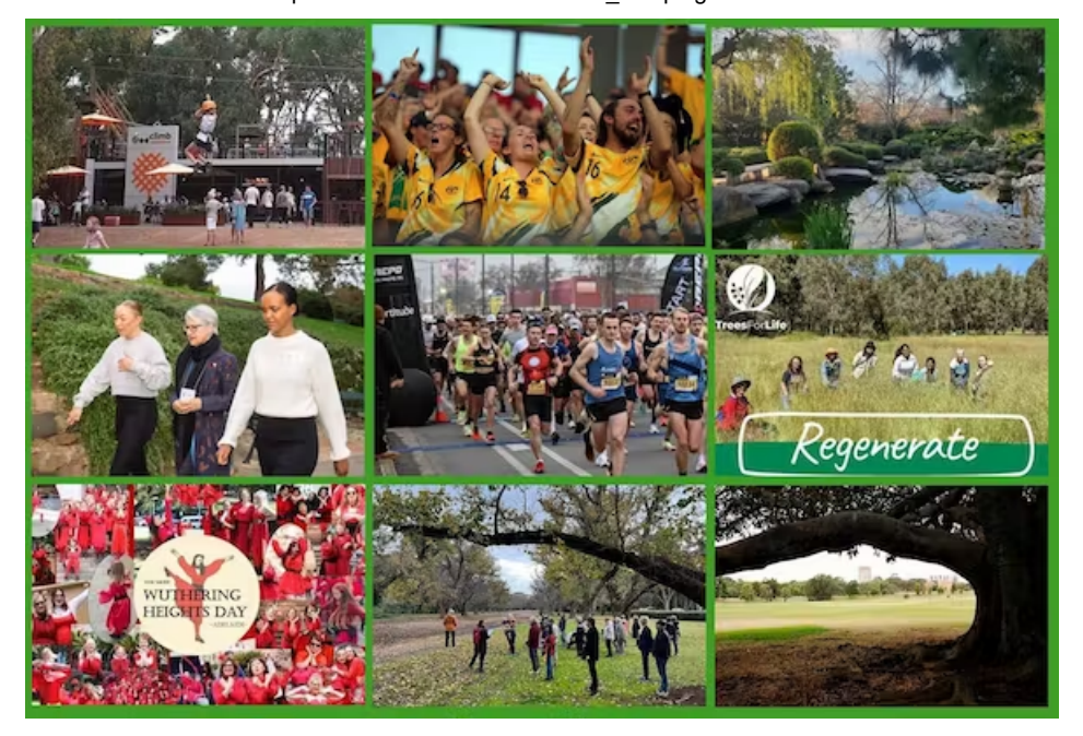
Read more >>>