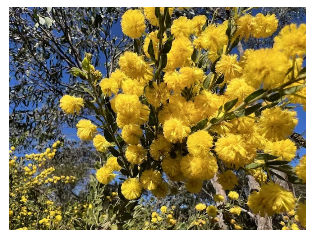
Read more >>>