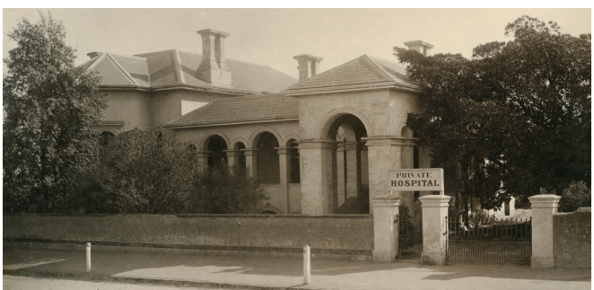
Calvary Hospital in the 1880s.

State Heritage-listed, since 1900 operated by the Catholic order of the "Sisters of the Little Company of Mary."