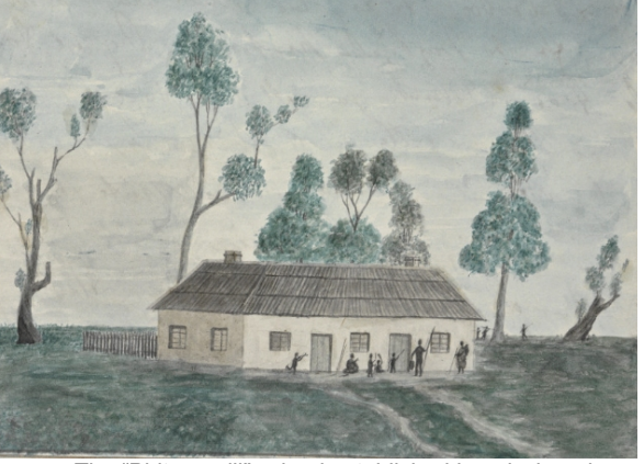
The "Pirltawardli" school established by missionaries

No trace remains of the site where Kaurna people were "located" or confined from 1838 to 1845. It's now the Par 3 golf course. Lutheran missionaries built this school.