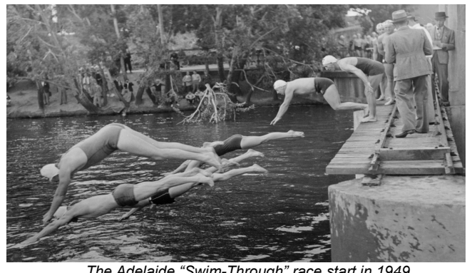
The Adelaide "Swim-Through" race start in 1949.

Built in 1881, the weir created Torrens lake; enabling boating and swimming.