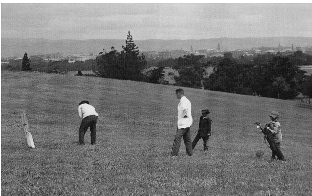
Playing golf in Park 1, in 1923

First played in this Park from the 1890s. The City Council operated golf links here from 1921, expanding with the South Course from 1950, and the Par-3 course from the 1960s on the site of the former "native location".