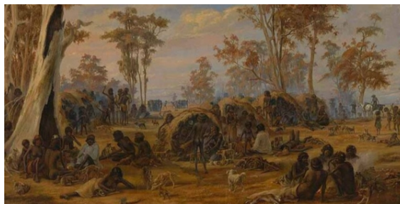
Painting :Alexander Schramm (1850)

Before European settlement Botanic Creek was used as a meeting place for the Kaurna community and especially where the creek emptied into a waterhole that later became the lake in the Botanic Garden.