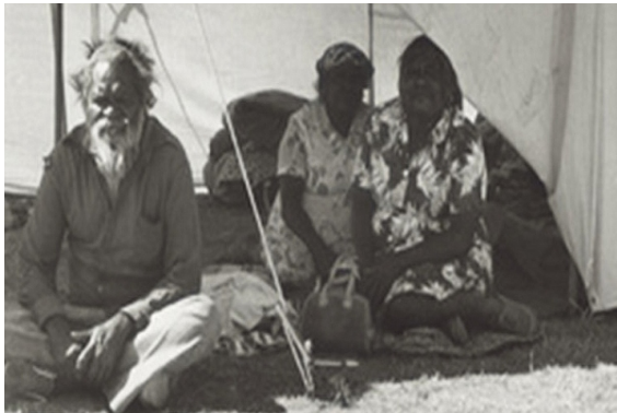
Pitjantjatjara campsite here in 1980.

In 1980, indigenous Pitjantjatjara and Yankunytjatjara people established a camp here in a symbolic action to confront the State Government over land rights.