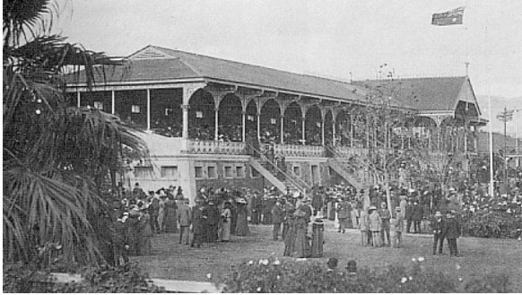
The Grandstand on a race day, 1912.

The gates, RAC building and turnstiles are heritage-listed reminders of horse-racing history, each one re-purposed for commercial purposes. The 1882 grandstand is the oldest surviving building in this Park.