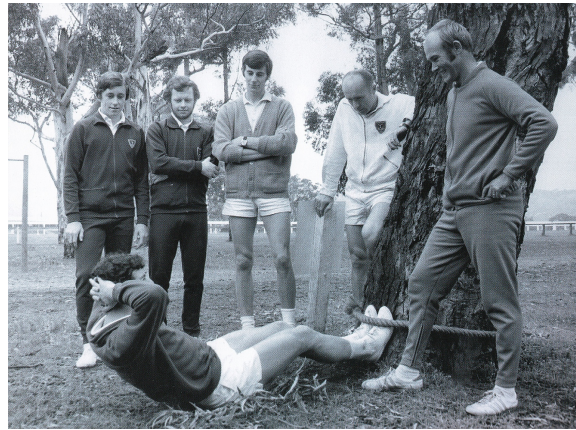
"Fitness track" opening – 1971

The creek is an artificial channel draining into Botanic lake - lined with bluestone since about 1920.