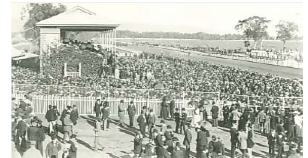
A race-day scene about 1900

As early as 1840, horse racing dominated this Park, and was popular for more than 150 years – finally moving out in 2007.