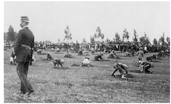
Arbor day, June 1889. Schoolchildren planting trees in this Park.

Many of the trees in this part of the Park still survive after being planted by schoolchildren in 1889.