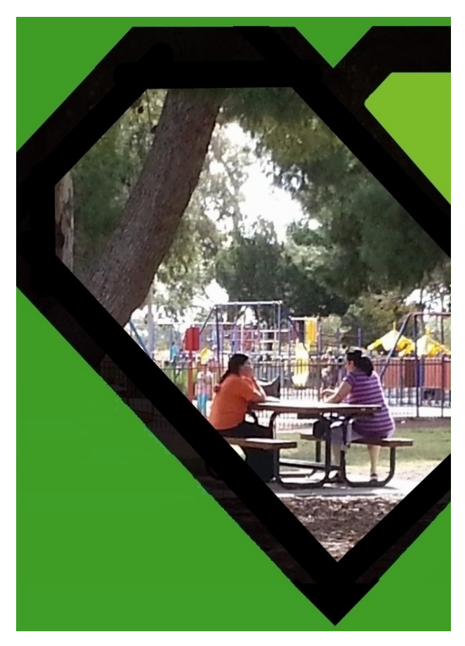
This Trail Guide traverses traditional lands of the Kaurna people. We acknowledge and pay respect to the past, present and future traditional custodians and elders of this land.

Scan the QR code on the back of this leaflet for the full trail guide