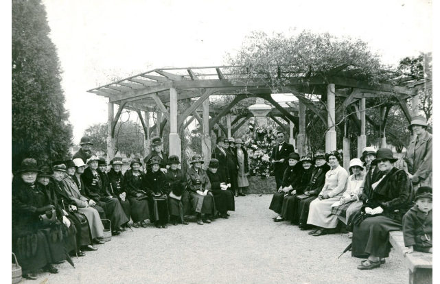
Wattle Day 1927 at this site

This Park's name means the same in English and in the Kaurua language.