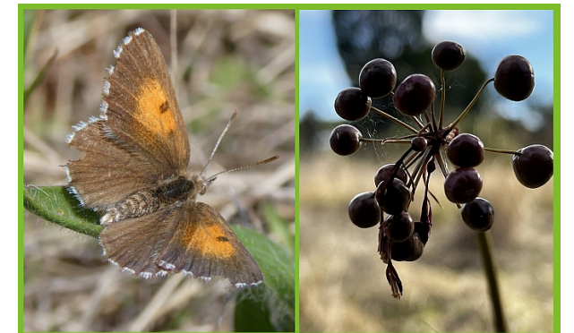
Chequered copper butterfly and garland lily

Volunteers have re-vegetated this area since 2015. 70 plant species are now recorded here, as well as the rare chequered copper butterfly.