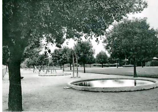
Playground pictured in 1929

Opened 1929. Still has original Edwardian-style shelter. Upgraded in 1960s, 1980s, 2014 & 2023.