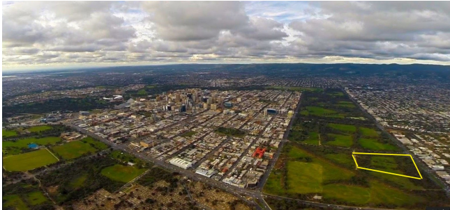
Proposed area of 8ha police barracks, including a Bush for Life site.

In 2023, SA Police nominated this Park as the preferred site for a new 8-hectare barracks; plus stabling, garaging behind security fences. Two massive protests led to a backdown.