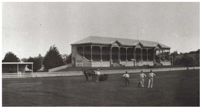
Adelaide Oval, 1882

First used for sport in 1840. Now controlled by an 8member Board. Hotel added in 2020 despite City Council objections.