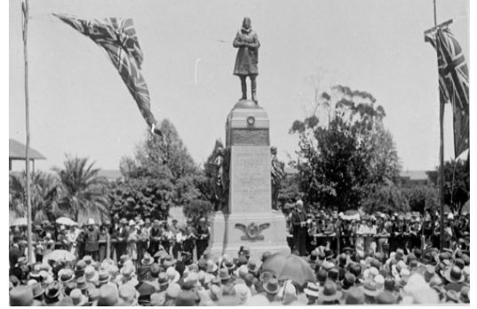
Statue unveiling, 1927 The oak was planted 1914, only days after WW1 outbreak.

2. Sir Ross Smith statue & War Memorial Oak Both are State Heritage-listed. A pioneer aviator Ross Smith was the first to fly from England to Australia (1919).