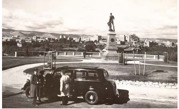
Light's vision, 1940s

10. Montefiore Hill / Light's vision The statue was erected in 1906 in Victoria Square, and moved here in 1938 soon after SA's centenary.