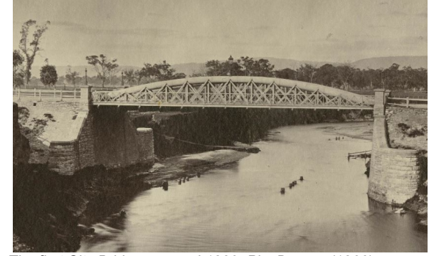
The first City Bridge, opened 1839. Pic: Duryea (1866)

The current bridge was built 1931. It was the third at the site with earlier ones inadequate for a growing city.