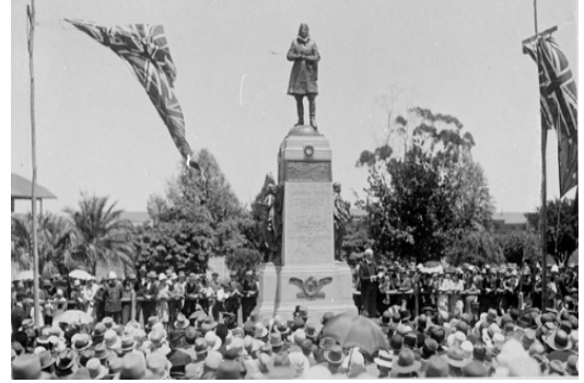
Statue unveiling, 1927 The oak was planted 1914, only days after WW1 outbreak.

2. Sir Ross Smith statue & War Memorial Oak Both are State Heritage-listed. Pioneer aviator Ross Smith was the first to fly from England to Australia (1919).