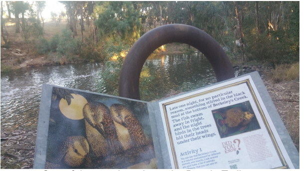
One of the storyboards on the Bunyip Trail

A 500-metre riverside trail, with nine storyboards and suggested activites. Like the book on which it's based, it ends at a secluded billabong. Look for the bunyip!