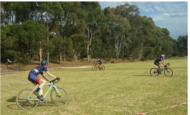
Cyclocross (CX) racing in John E. Brown Park

This open area was used by model aircraft enthusiasts from 1955. It is still used occasionally for the sport of cyclocross (CX) bicycle racing, cross-country.