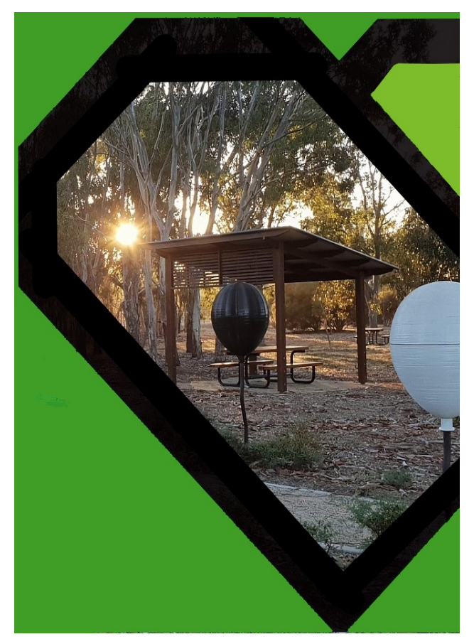
This trail guide traverses traditional lands of the Kaurna people. We acknowledge and pay respect to the past, present and future traditional custodians and elders of this land.

Scan the QR code on the back of this leaflet for the full Trail Guide