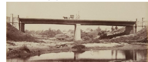
Victoria Bridge, 1870

10. Victoria Bridge The current bridge that spans both the railway lines and the River Torrens, was erected in the 1960s. It replaced an earlier one from 1870.