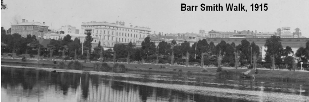
Barr Smith Walk, 1915

Established in early 1900s with a line of poplar trees along the water's edge.