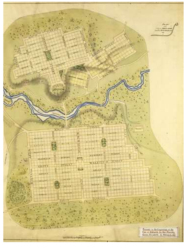
Figure 1: Light's plan, 1837: ACC CC001383.

General intentions of Colonel William Light in establishing the first Plan of Adelaide in 1837